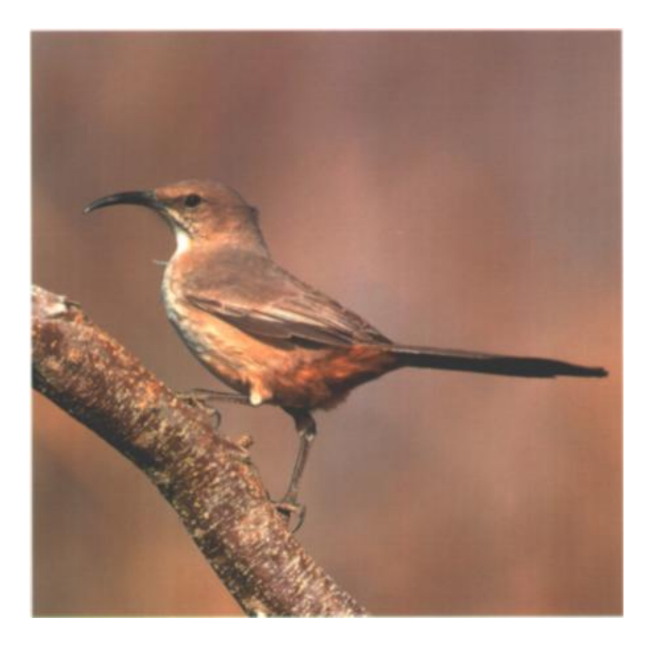
Le Conte's Thrasher ( Toxostoma lecontei ), Inyokern, Kern County, California, March 2002.