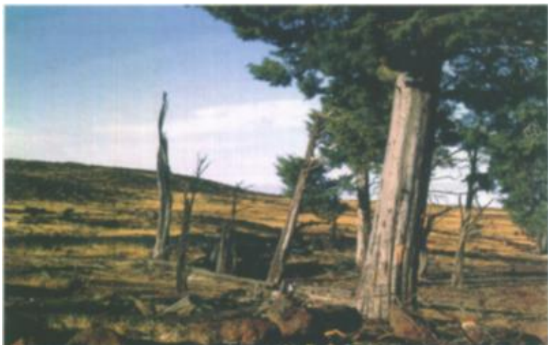
Figure 1. View northwest from remaining cypress grove. Young trees do not exist and older trees (such as the one in foreground) have had pieces of bark stripped by goats.