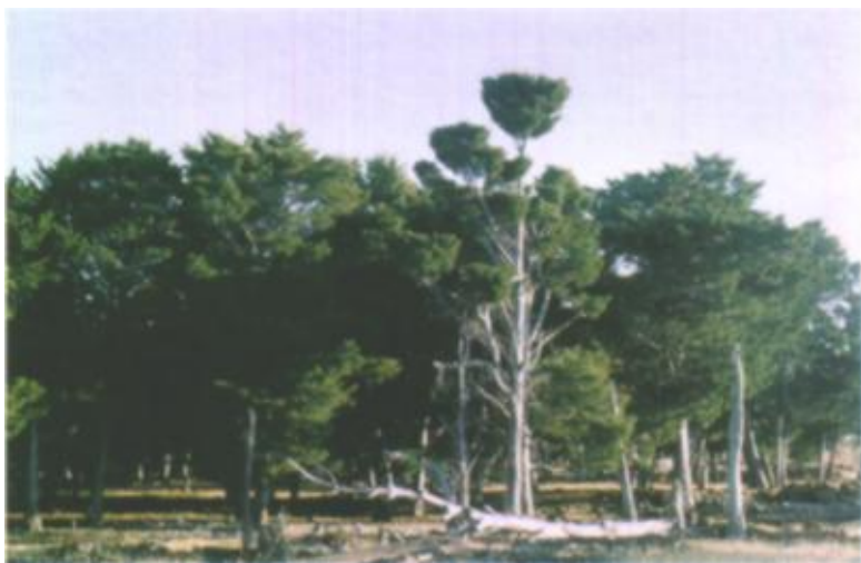
Figure 2. View into remnants of cypress grove, showing lack of understory.