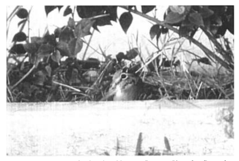
Figure 1. American Woodcock at Iron Mountain Pumping Plant, San Bernardino County, California, 9 November 1998. The black barring on the rear crown is diagnostic of Scolopax .