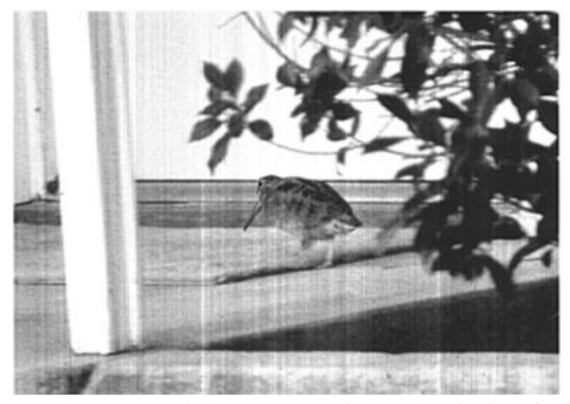
Figure 3. American Woodcock at Iron Mountain Pumping Plant, San Bernardino County, California, 9 November 1998. Note the bold gray "V" on the mantle and the gray stripes through the scapulars.