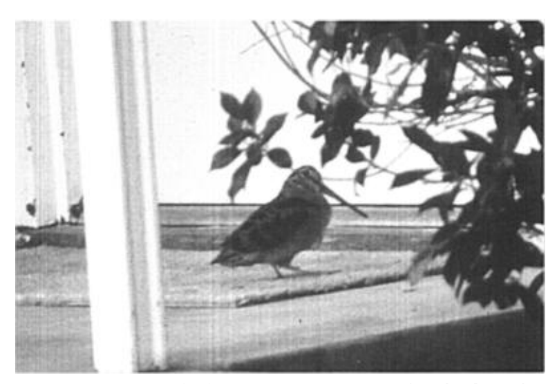
Figure 2. American Woodcock at Iron Mountain Pumping Plant, San Bernardino County, California, 9 November 1998. Note the unbarred cinnamon underparts.