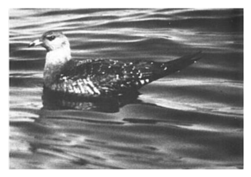
Figure 5. This immature jaeger at Lake Havasu 4 September 1977, originally identified as a Pomarine, was finally accepted as a Long-tailed.