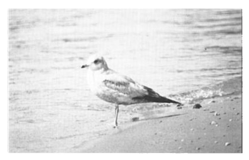
Figure 6. Arizona's fifth Mew Gull at Lake Havasu City, 4 March 1995.