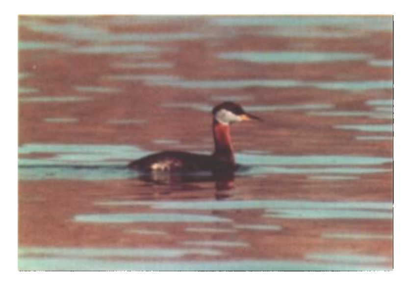
Figure 1. Arizona's first Red-necked Grebe on Lake Havasu, 23 March 1981.