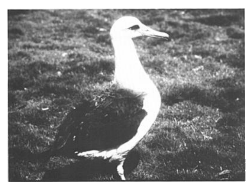
Figure 2. An amazing addition to the Arizona list was this Laysan Albatross picked up on a street in Yurna 14 May 1981. It was later brought to Sea World in San Diego.