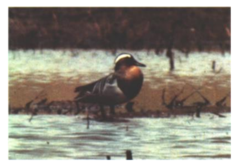
Figure 4. This first Garganey for Arizona was at Buenos Aires National Wildlife Refuge 10 April 1988.