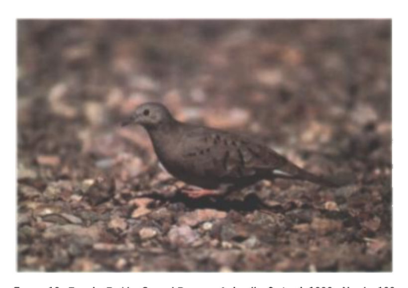
Figure 10. Female Ruddy Ground-Dove at Lukeville 3 April 1990. Nearly 100 individuals have been found in Arizona since 1981.