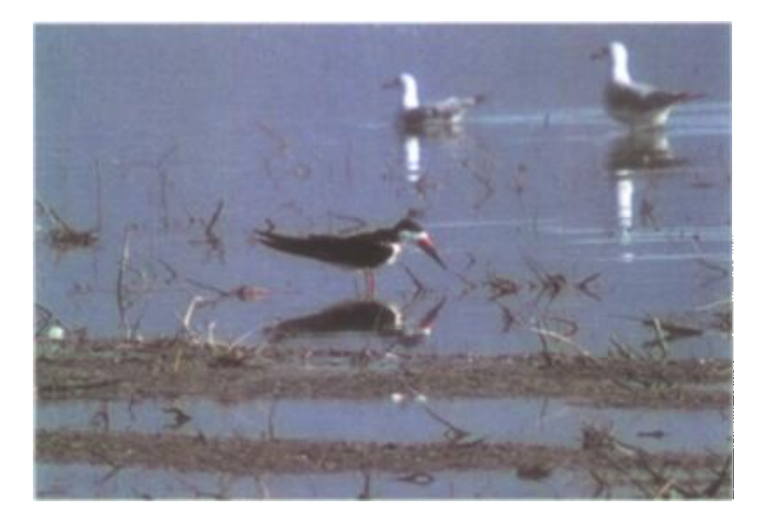
Figure 9. Black Skimmer at Painted Rock Reservoir, 14 July 1993.