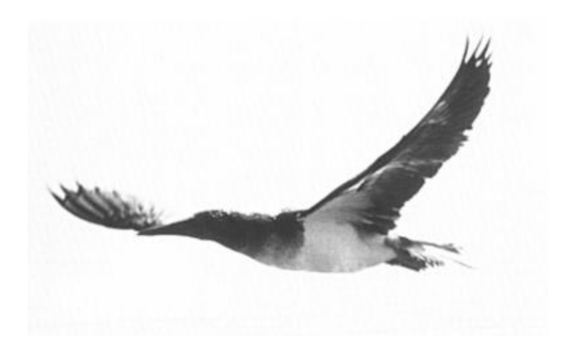
Figure 3. Always out of place in the Southwest, this Blue-footed Booby frequented a golf course pond outside of Phoenix 25 September-19 October 1996.