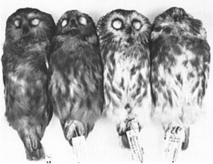
Figure 2. Northern Saw-whet Owls. From left to right, A. a. brooksi (CMN 14053), male, Masset, Queen Charlotte Islands, 5 July 1919; A. a. brooksi (QCIM 8.1), male, 15 km south of Tlell, Queen Charlotte Islands, December 1978; A. a. acadicus (RBCM 15015), male, Peachland, British Columbia, 7 November 1952; A. a. acadicus (RBCM 13014), male, Merville, British Columbia, 6 November 1953.

identified. Females are larger than males in both subspecies, and the subspecies are about the same size (Cannings 1993).