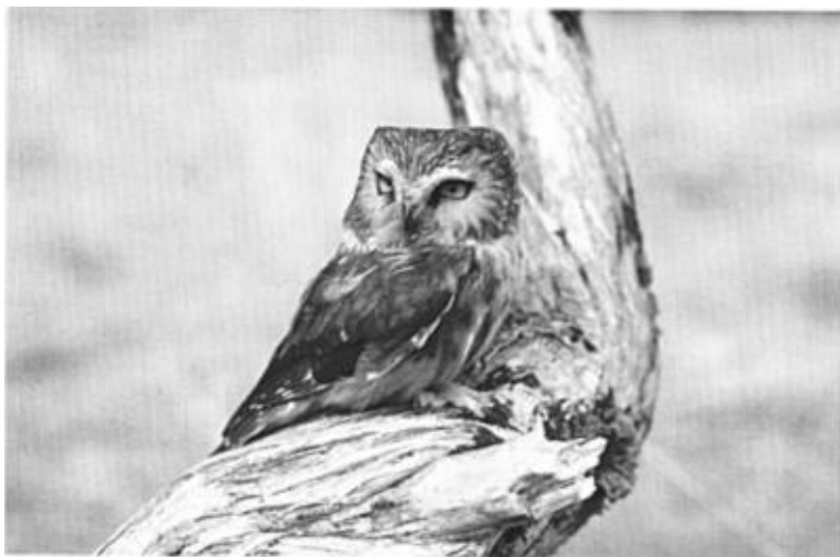
Figure 1. Northern Saw-whet Owl ( Aegolius acadicus brooksi ) on Langara Island, Queen Charlotte Islands, British Columbia, 5 April 1971.

A. a. brooksi differs strikingly from acadicus in its darker coloration, particularly on the breast and facial disk (Figures 1 and 2). Everywhere acadicus is white, brooksi is buff (Tawny Olive, Smithe 1975–1981). All of the browns are much deeper and richer in brooksi than in acadicus . Should brooksi occur off the Queen Charlotte Islands, therefore, it should be recognized readily. No intergrades between the two subspecies have been