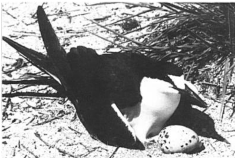
Figure 4. Incubating Sooty Tern, Wake Atoll.

Bailey (1951) described the Sooty Tern colony on Peale Island as "the largest I had ever seen," suggesting that it was much larger than the one I observed, although he