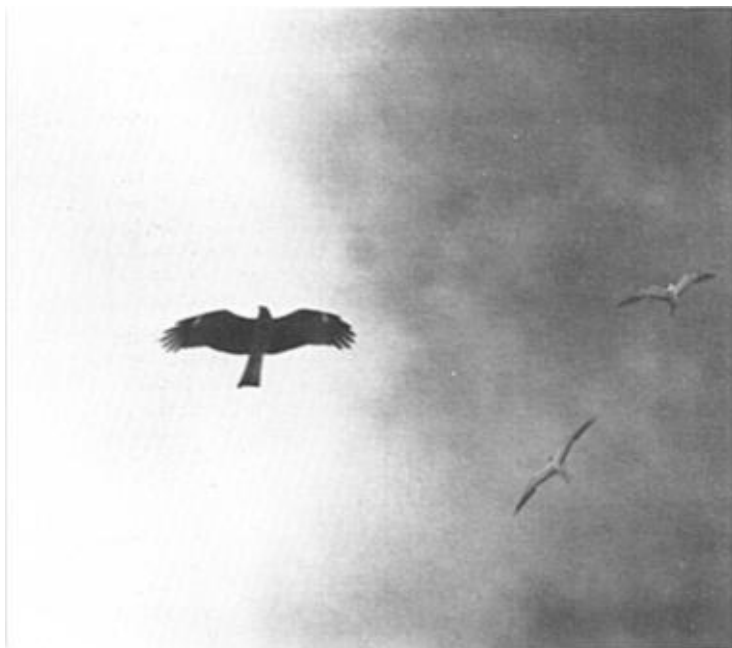
Figure 3. Black Kite in flight, Wake Atoll, early 1980s.