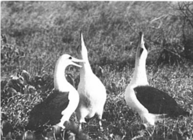
Figure 1. Laysan Albatross courting, Wake Atoll.

White-tailed Tropicbird Phaethon lepturus . I briefly saw one adult in flight near the rain catchment basins between the personnel housing area and the air terminal on 25 March. Hitchcock sees them every year and believes that a few breed. Fosberg (1966) reported one near Flipper Point in September 1961 and two on Wilkes Island on 8 March 1963. Casey (1966) reported two adults with one chick in the rubble of an old Japanese blockhouse on the island during her visit in 1966 (specific date not given). This species breeds primarily on high islands, in trees in the interior or in shaded rock crevices along coastal headlands, but also nests in small numbers on low-lying atolls such as at Midway Island (Harrison 1990).