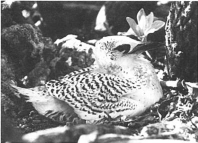
Figure 2. Nestling Red-tailed Tropicbird, Wake Atoll.

Brown Booby Sula leucogaster . I located two adjacent colonies of approximately 30 and 26 nests on the outer perimeter of the Wilkes Island Sooty Tern colony. Young were in all stages of growth from recently hatched to nearly full-sized downy with moderately developed flight feathers. No nest contained more than two young, and all nests with well-developed young had only one. I saw no eggs, but several