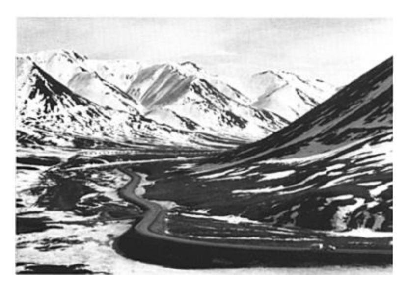
Figure 2. Spring break-up along the Dalton Highway and Trans-Alaska pipeline, in the Central Foothills region, Brooks Range, Alaska.

In this the most southern of the three regions, the Brooks Range dominates the landscape. Peaks range from 2134 to 2438 m in elevation, with rugged ridges extending east—west (Figure 2). The low, sparse alpine tundra vegetation of these mountains is composed of lichens, mat and cushion plants, and dwarf shrubs. The northern part of this region is characterized by numerous east—west ridges rising to about 360 m, interspersed with rolling plains and braided streams (Sage 1974). The dominant habitat is tussock-heath tundra, characterized by cottongrass (Eriophorum vaginatum), mountain avens (Dryas integrifolia), dwarf birch (Betula nana), cranberries and blueberries (Vaccinium spp.), Labrador tea (Ledum decumbens), and other shrubs. Willow (Salix spp.) thickets along streams and rivers and local patches of tall brush provide important habitat for passerines. Many areas away from the Dalton Highway, such as the White Hills, remain poorly explored from an avifaunal standpoint.