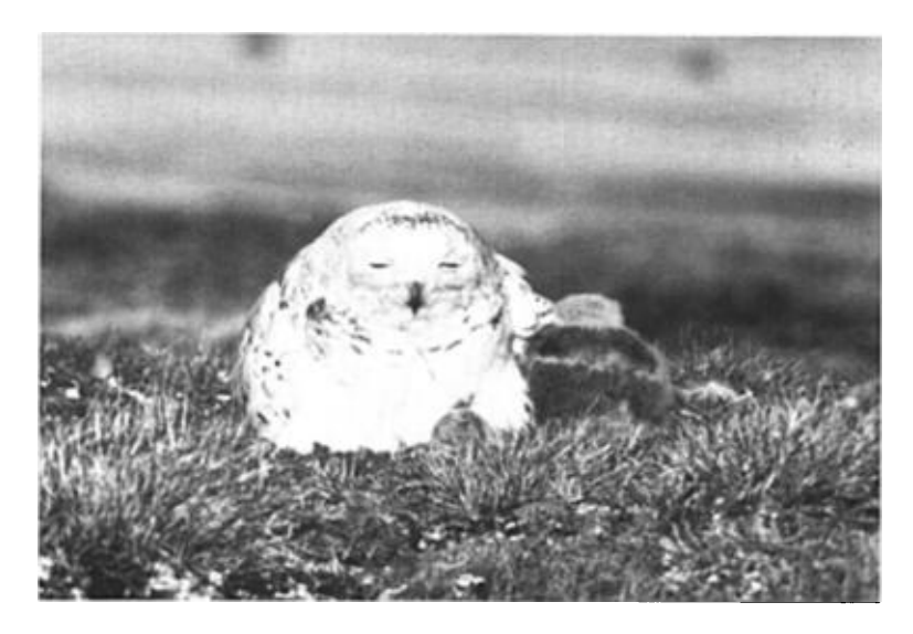
Figure 7. Female Snowy Owl (Nyctea scandiaca) at a nest in tundra of the wet coastal plain.

Progne subis. Purple Martin. PB: The single record, of a female near Deadhorse 12 June 1986 (DMT), is the only record for Alaska's north slope.