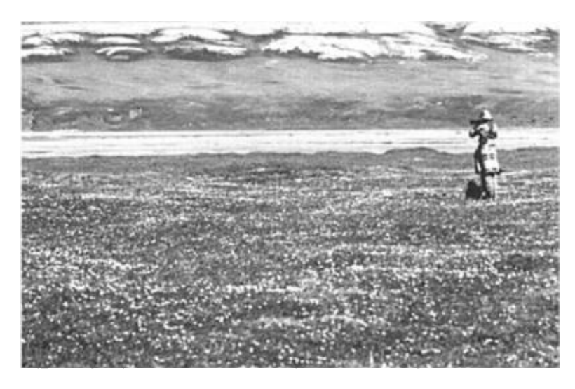
Figure 3. Representative habitat, characterized by Dryas and Eriophorum, along Franklin Bluffs and the Sagavanirktok River.