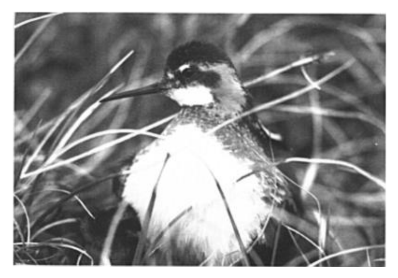
Figure 5. Male Red-necked Phalarope ( Phalaropus lobatus ) brooding young at a nest on the wet coastal plain.