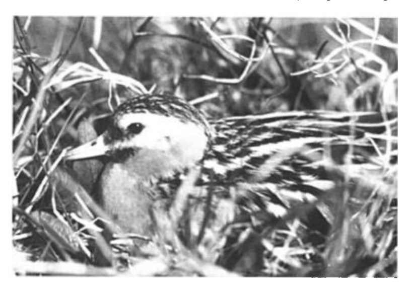
Figure 6. Male Red Phalarope ( Phalaropus\ fulicaria ) brooding young at a nest on the wet coastal plain.