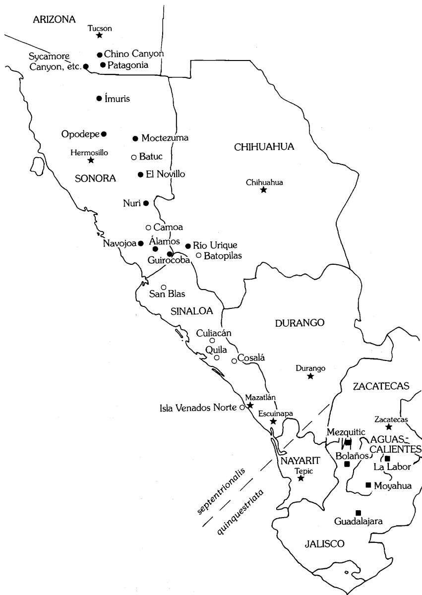
Figure 1. Seasonal distribution of the races of the Five-striped Sparrow. Solid circles, Aimophila q. septentrionalis , late April to September; open circles, A. q. septentrionalis , October to early April only; squares, A. q. quinquestrata .