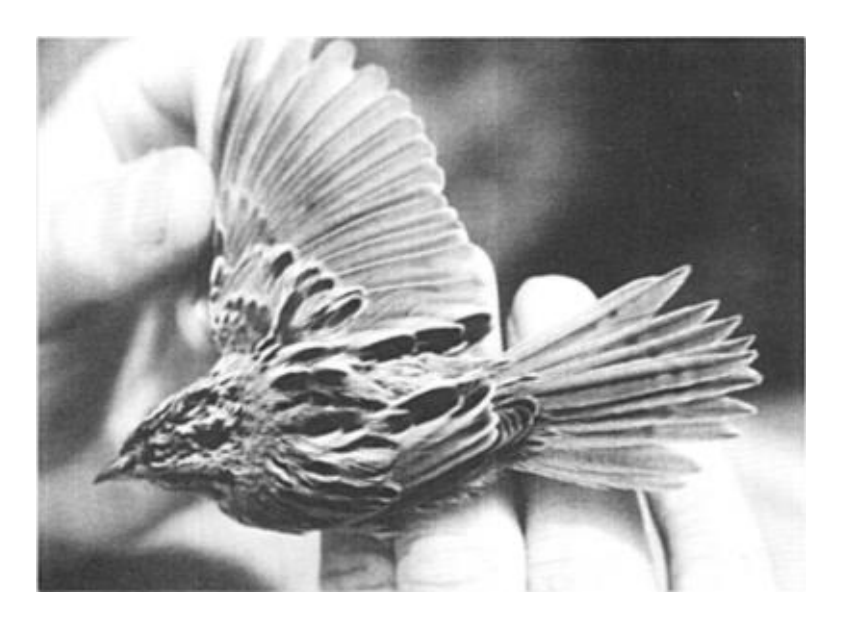
Figure 11. Juvenile Le Conte's Sparrow (Ammodramus leconteii) on Southeast Farallon Island, San Francisco County, California, 11–12 Sep 1986.