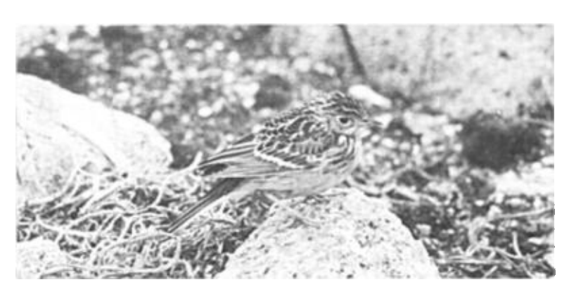
Figure 4. Sprague's Pipit (Anthus spragueii) on Southeast Farallon Island, San Francisco County, California, 10–11 Oct 1986.