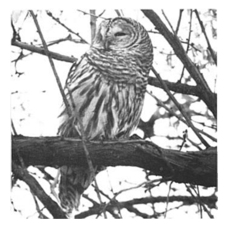
Figure 3. California's first Barred Owl (Strix varia) recorded east of the Coast Ranges at Tule Lake Northwest Reserve, Siskiyou County, 28 Nov 1986–21 Feb 1987.