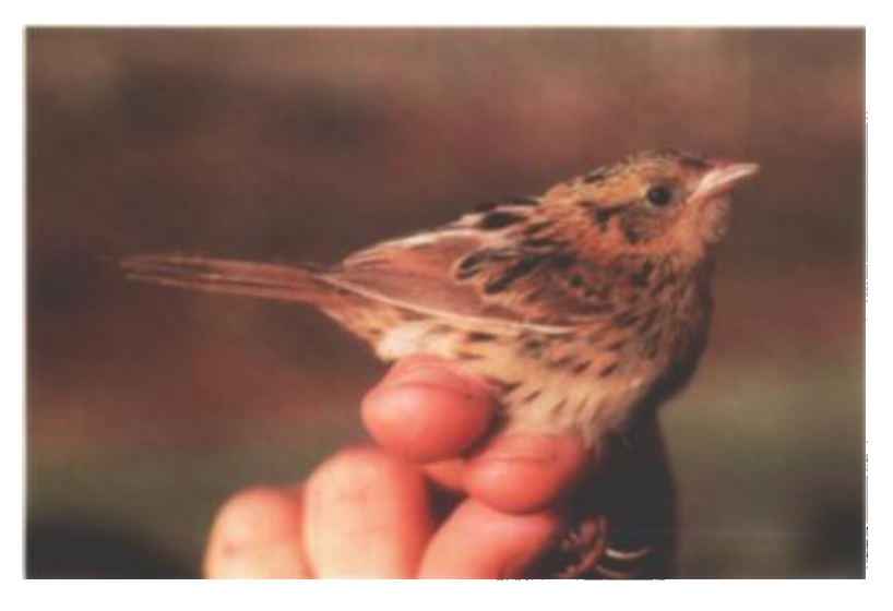
Figure 10. Juvenile Le Conte's Sparrow (Ammodramus leconteii) on Southeast Farallon Island, San Francisco County, California, 11–12 Sep 1986.

GRAY CATBIRD Dumetella carolinensis (32). One was at Deep Springs, INY, 6 Oct 1975 (PRS; 254-1986). Another was at Scotty's Castle, INY, 9 Sept 1981 (JSt;