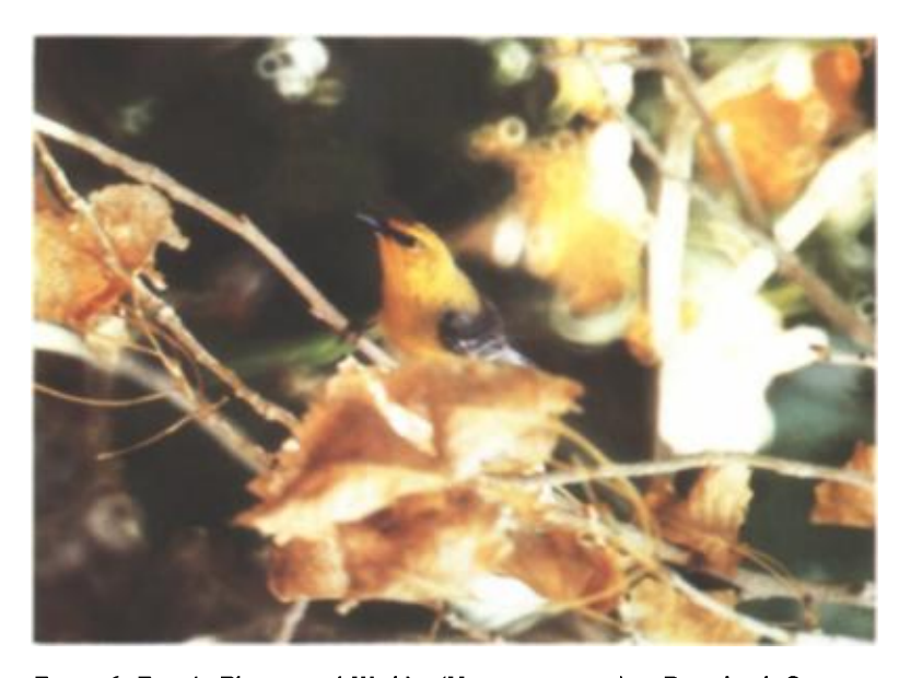
Figure 6. Female Blue-winged Warbler (Vermivora pinus) at Butterbredt Springs, Kern County, California, 29–30 May 1987.

BUFF-BREASTED SANDPIPER Tryngites subruficollis (42). One was at Año Nuevo State Reserve, SM, 1–4 Sep 1978 (EB; 197-1986). One was at Arcata marsh, HUM, 25 Aug–2 Sep 1979 (RLeV; 325-1986). Up to five birds were at Arcata bottoms, HUM, 15–25 Sep 1982 (RAE; 165-1986). Two birds were at Salinas sewage ponds, MTY, 28 Aug–2 Sep 1986 (SFB, JC, MaD†, MDa†, SEF,