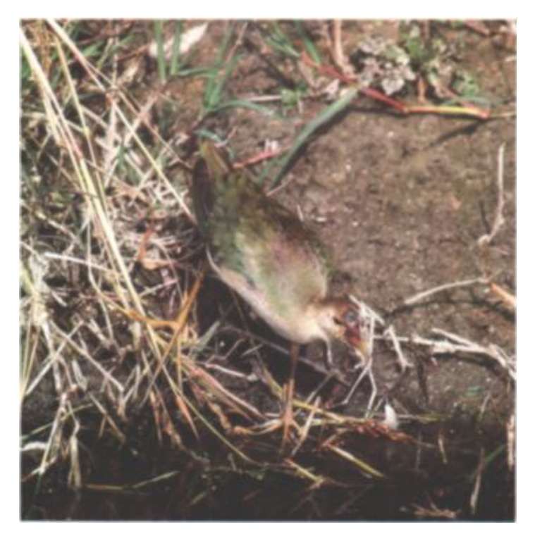
Figure 2. California's second recorded Purple Gallinule ( Porphyrula martinica ) at Lake Elizabeth, Fremont, Alameda County, 17–27 Oct 1986.

MONGOLIAN PLOVER Charadrius mongolus (2). An adult in alternate plumage was at the Santa Clara River mouth, VEN, 12–17 Jul 1986 (JSR; JLD†, SEF, MJL, VK†; 300-1986). This bird was probably the same as one present at this location in 1982 (74-1982, Morlan 1985) and 1983 (65-1983, Roberson 1986). Because there was only one previous state record, a majority of the Committee suspected that this bird was more likely missed in 1984 and 1985 rather than a different individual.