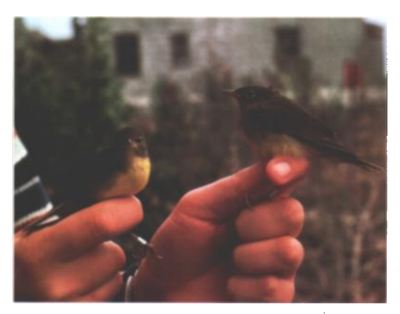
Figure 8. One Mourning Warbler ( Oporornis philadelphia ) and one Connecticut Warbler ( O. agilis ) on Southeast Farallon Island, San Francisco County, California, 12 Sep 1986.