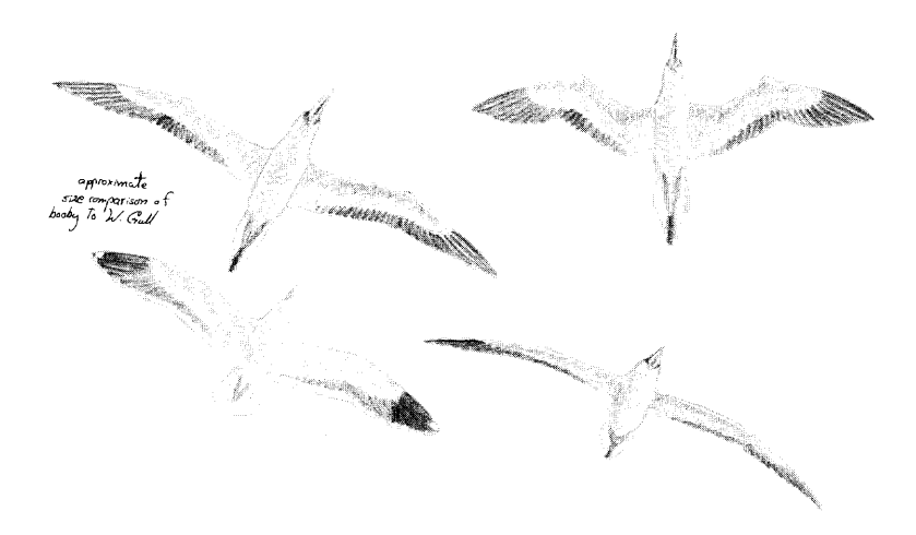
Figure 1. Three illustrations of the Red-footed Booby ( Sula sula ) with a Western Gull ( Larus occidentalis ) near Morro Rock, Morro Bay, San Luis Obispo County, California, 27 May 1986.

An Anhinga reported from Searsville Lake, SM, 28–30 May 1939, and cited in the Gull 21:70 as "undoubtedly" the same bird as seen on Lake Merced was not voted on by the Committee because no description accompanied the published report.