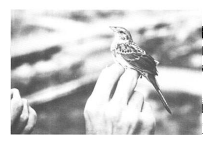
Figure 9. Cassin's Sparrow (Aimophila cassinii) on Southeast Farallon Island, San Francisco County, California, 22 Sep 1986.

GREATER PEWEE Contopus pertinax (20). One was at Earp, SBE, 22 Dec 1983 (JSt; 90-1986). One at Montecito, SBA, 28 Dec 1985 (JEL; 189-1986), is considered to be the same bird present there the previous winter (265-1984, Dunn 1988).