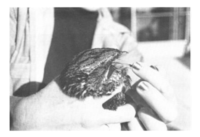
Figure 1. Head of Chuck-will's-widow picked up at Half Moon Bay. San Mateo Co.. California. Note lateral filaments on rictal bristles.