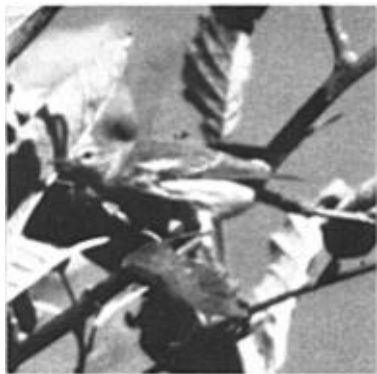
Cape May Warbler. Bayocean Sandspit, Tillamook Co., Oregon, 19 October 1980.