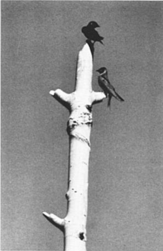
Figure 1. Nesting pair of Purple Martins perched in a Quaking Aspen snag adjacent to the nest tree in southwest Colorado, 18 km northeast of Stoner, July 1978.

In early September 1978, the first martin nest tree was felled along with all remaining trees during a clean-up operation of the harvested area. On 20 and 21 June 1979, a pair of Purple Martins was seen in an open area around a beaver pond 0.75 km from the 1978 nest site. The male martin was observed making unsuccessful attempts to establish a nest in a hole occupied by a Tree Swallow ( Iridoprocne bicolor ). Although an effort was made to locate the martins, they were not seen in the area again that summer and fall. Presumably, the martins left after failing to secure a suitable nest site. The swallows prefer to nest in tree cavities in relatively open areas where they can fly to and from the nest sites. Such areas are limited in old growth aspen stands. Modification of clear-cutting practices to leave cull and dead aspen trees, either scattered or in groups, would provide many suitable nesting sites for Purple Martins and other swallows.