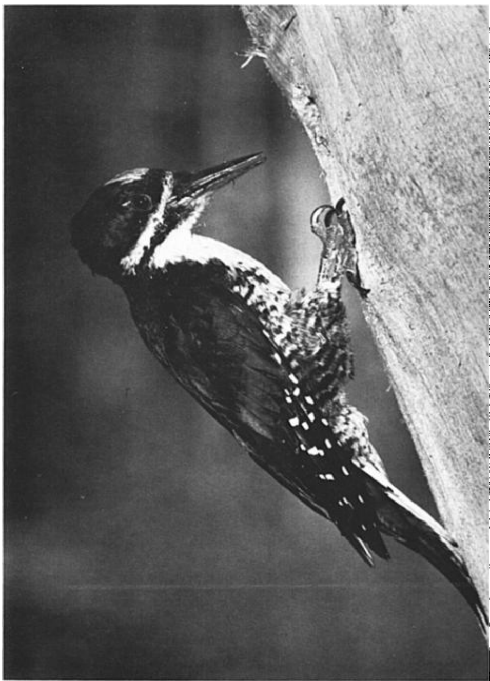
Black-backed Three-toed Woodpecker ( Picoides arcticus ), July 1977, Antelope Creek near Tennant, eastern Siskiyou County, California. Nikkormat FTN, 200 mm lens, f/8. K-64 film.