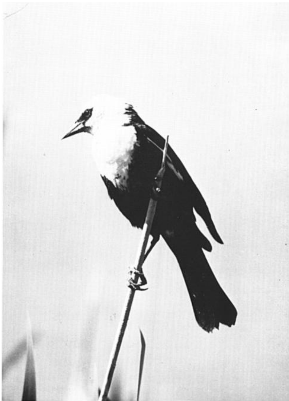
Yellow-headed Blackbird ( Xanthocephalus xanthocephalus ), 16 June 1977, Lower Klamath NWR, Siskiyou County, California. Nikon, 400 mm lens, f/5.6 at 1/250 sec., K-64 film.