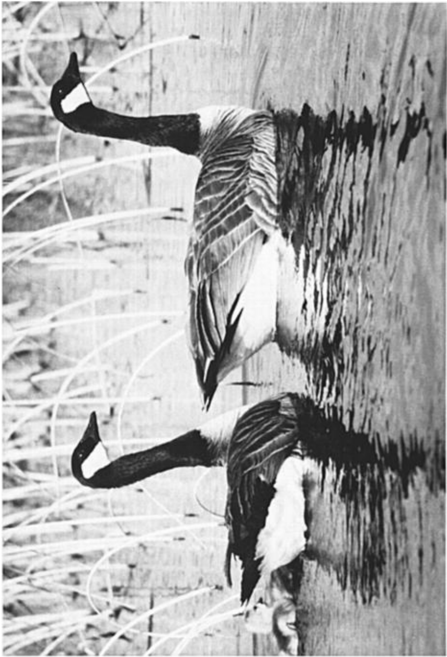
Canada Geese ( Branta canadensis ), spring (April or May) 1976, Grass Lake on Highway 97, Siskiyou County, California Nikon, 400 mm lens, f/5.6 at 1/500 sec., K-64 film