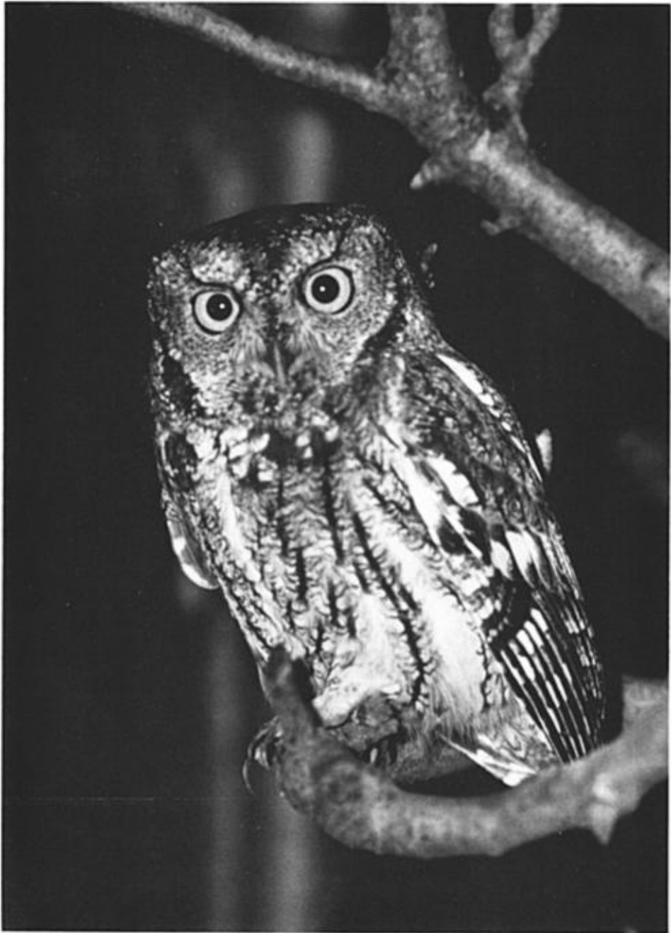
Screech Owl ( Otus asio ), autumn (probably November) 1973, Shasta Valley near Yreka, Siskiyou County, California. Nikkormat FTN, 200 mm lens with flash, f/8, K-64 film.