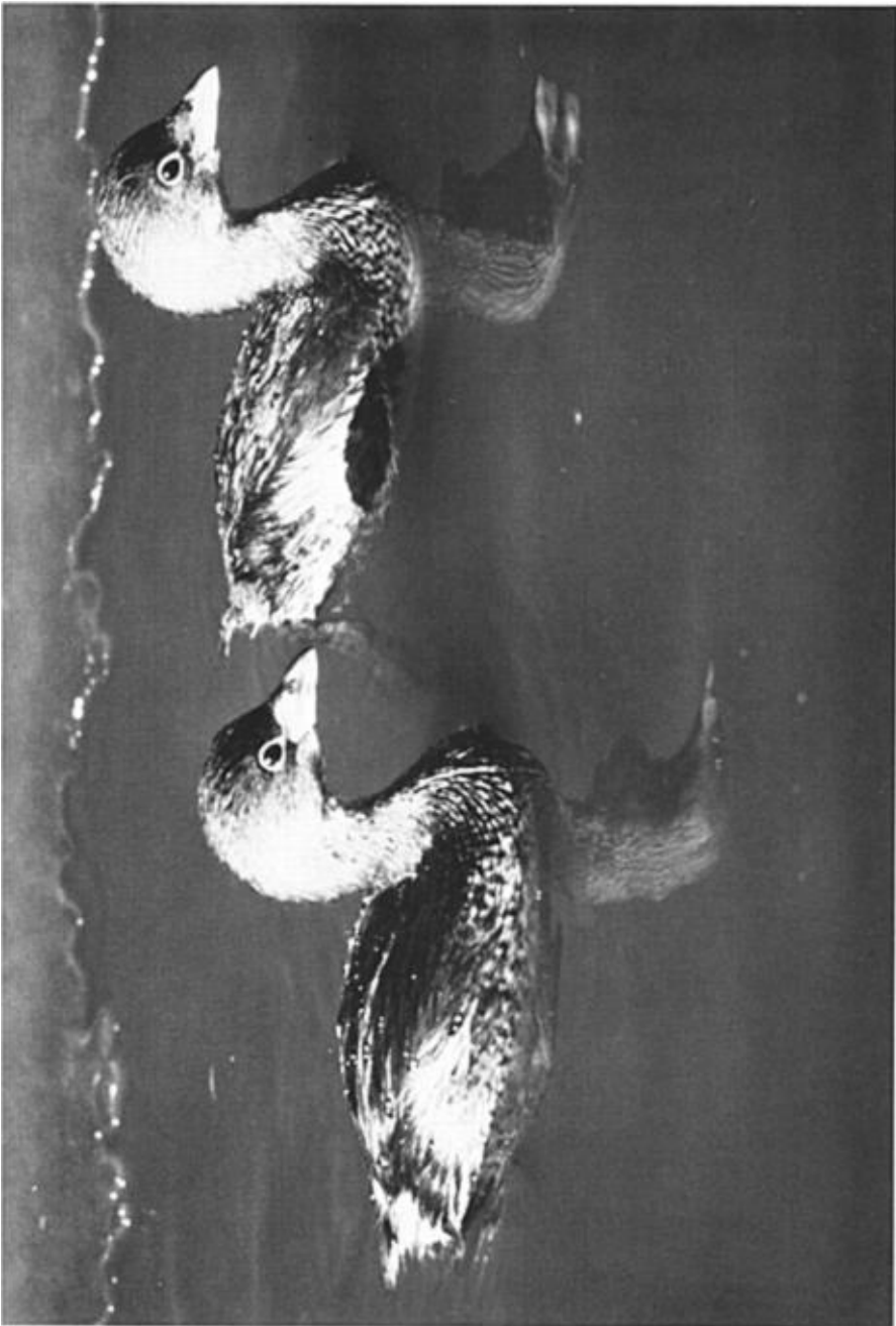
Pied-billed Grebes ( Podilymbus podiceps ). 6 February 1976. Lower Klamath NWR, Siskiyou County, California. Nikon, 400 mm lens, f/5.6 at 1/250 sec., K-64 film