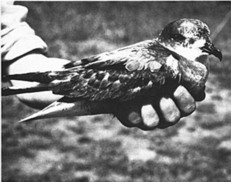
Figure 1. Scaled Petrel ( Pterodroma inexpectata ) (18-1978), 1 May 1977, Bolinas Lagoon, Marin Co., California.