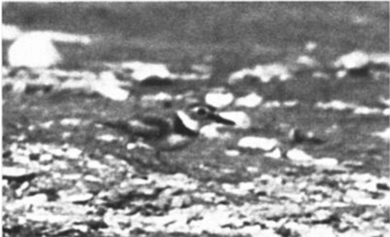
Figure 2. Wilson's Plover ( Charadrius wilsonia ) (74-1977), 28 Jun 1977, McGrath State Beach, Ventura Co., California.