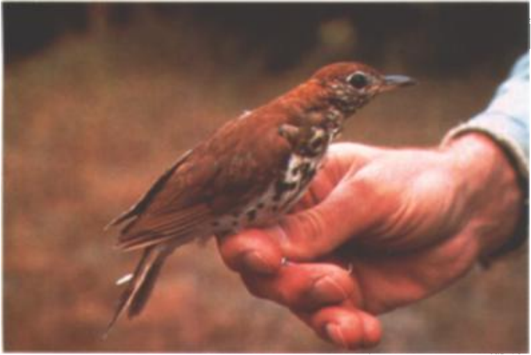
Figure 3. Wood Thrush ( Hyalocichla mustelina ) (80-1977), 18 Jun 1977, Palomarin, Marin Co, California.