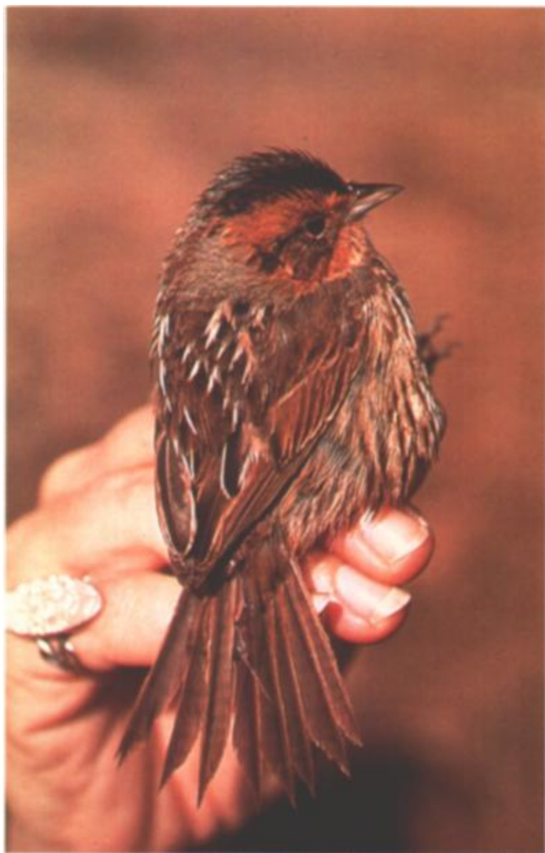
Figure 5. Sharp-tailed Sparrow ( Ammodramus caudacuta ) (14-1977), 6 Feb 1977, Bolinas Lagoon, Marin Co., California.