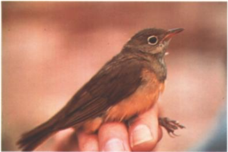
Figure 4. Connecticut Warbler ( Oporornis agilis ) (17-1978), 19 Jun 1976, SE Farallon Island, San Francisco Co., California.