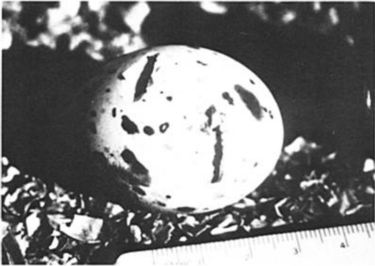
Figure 1. Punctured egg of Black Skimmer at Salton Sea, California.

Incubation. Both sexes incubate, but much variation occurred. It was hot (34-38°C) and nest relief occurred every 3-4 minutes when we first discovered the colony on 16 August. Our initial disturbance may have caused the rapid nest relief. It was at this time that we observed "foot-wetting" (Turner and Gerhart 1971) and other cooling mechanisms (to be discussed more fully elsewhere). Three nests were watched closely on 30 August from 1543 to 1820 to determine the amount of incubation by each sex (Table 2). Tomkins (1933) and Bent (1921) felt that females did all of the incubating and Pettingill (1937) felt these chores were shared equally. Modha and Coe (1969) reported that in the African Skimmer ( Rynchops flavirostris ), the parents took turns incubating. Sexes can be determined in the field by size differences. The male appears larger both on the ground and in the air (when both sexes are