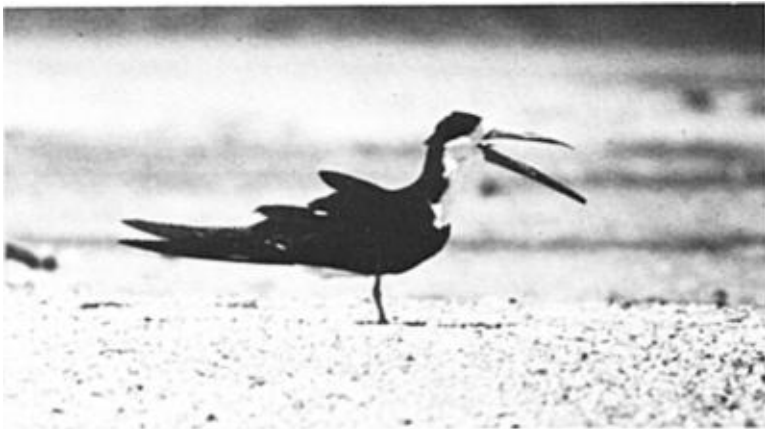
Figure 2. Some heat loss mechanisms of the Black Skimmer. Note panting; elevated crown, nape, and scapular feathers; shading of legs and feet; and slightly drooped and outward displaced wings.

Incubating birds oriented into the wind, almost without exception, but in still air orientation with respect to other skimmers was random. From 0715 to 1100 on 27 September all skimmers were facing into a NW wind (tail to sun) regardless of whether incubating, brooding, or in a resting flock. From 1100 to 1130 no wind occurred and bird positions were random. At 1130 the wind came from the SE and all birds faced into the wind and sun. Our observation position was unchanged during this time interval. Wind flow over the feather surface facilitates heat loss by convection. Ruffled feathers and orientation into the wind were important behavioral adjustments for desert nesting Gray Gulls ( Larus modestus ) in Chile (Howell et al. 1974).