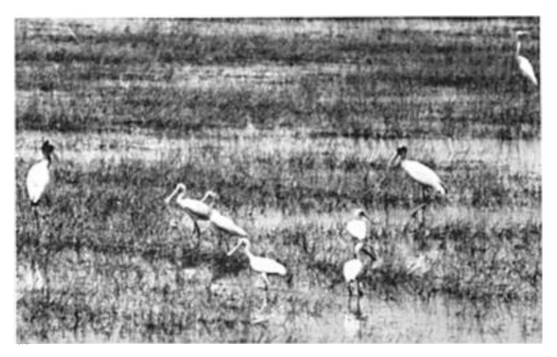
Figure 1 (UA12004). Wood Storks (Mycteria americana) and Roseate Spoonbills (Ajaia ajaja), 30 June 1973, NE of Yuma, Yuma Co.

WOOD STORK (Mycteria americana). Figure 1 (UA12004). Thirty-eight immatures on 30 June 1973 by S. and S. Liston were photographed, and an additional