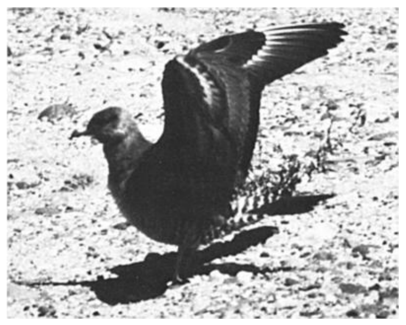
Figure 5 (UA12017). Jaeger sp., probably Parasitic (Stercorarius parasiticus), 20 September 1970, Phoenix, Maricopa Co.