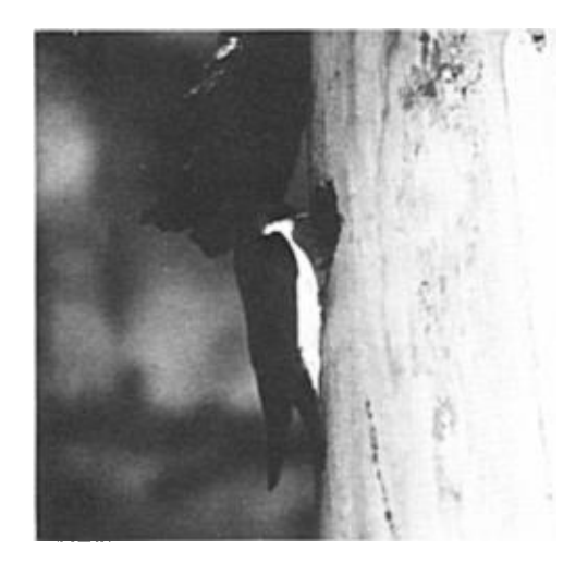
Figure 3 (UA12010). Tree Swallow (Iridoprocne bicolor), 18 July 1973, Jacob Lake, Coconino Co. First Arizona nesting record.

TREE SWALLOW (Iridoprocne bicolor). Figure 3 (UA12010). Two nests, 1 with two young observed from 15 July 1973 until young fledged 21 July 1973, photographed 18 July 1973; second nest found 21 July 1973; both near Jacob Lake, Kaibab National Forest, Coconino Co., in Quaking Aspen (Populus tremuloides), by R. and M. Wilson. This is the first recorded nesting of this species in Arizona.