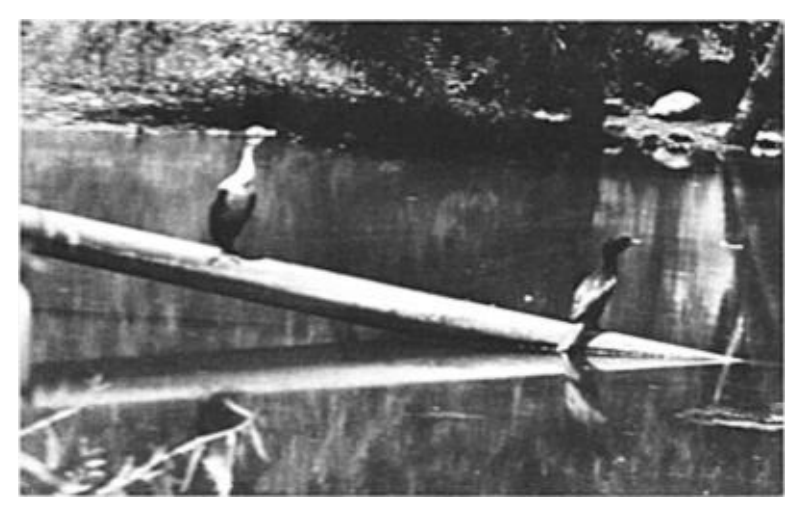
Figure 4 (UA12015). Double-crested Cormorant ( Phalacrocorax auritus ) and Olivaceous Cormorant ( P. olivaceus ), 29 July 1967, Yerba Buena Ranch, Santa Cruz Co.