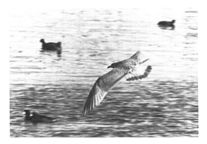
Figure 4. Juvenal Thayer's Gull, flight. Note the light primaries and the banded tail.