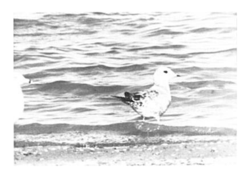
Figure 5. Juvenal Mew Gull (Larus canus) at Lake Mead, Clark County, Nevada 9 January 1972. Note the small black bill. Compare size to Ring-billed Gull (Larus delawarensis) on the left.