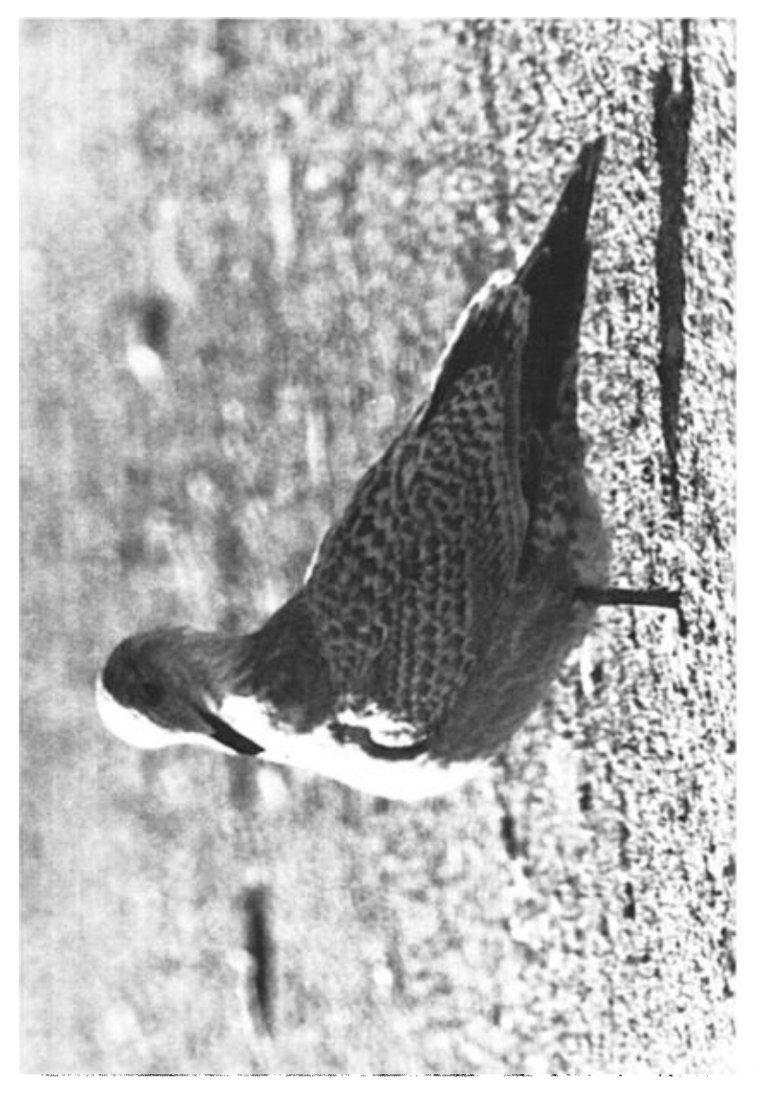
Figure 2. Juvenal Thayer's Gull (Larus thayeri) at Lake Mead, Clark County, Nevada 30 October 1971. Note the small headed and small billed appearance and the checkered pattern of the back.