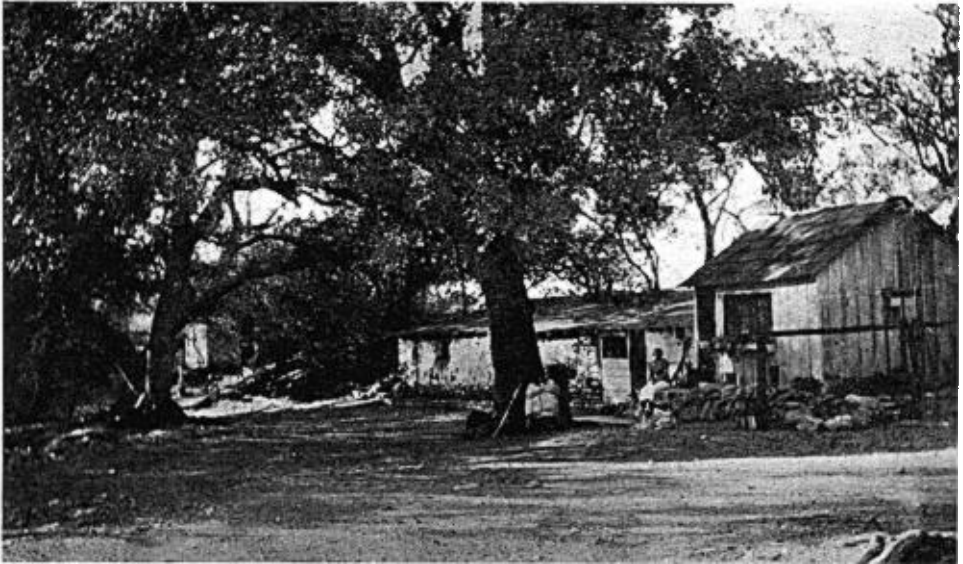
Fig. 3. MCCLEARY'S OF THE 1905 MAP: NOW NICHOLSON'S

The Santa Rita Mountains which rise from within a few miles of the Mexican border near Nogales and extend mainly northward in the direction of Tucson, for about twenty-five miles, lie west of the Huachuclas and east of the Santa Cruz River. The range rises from a base of about 3,500 feet on the west—only 500 feet above the Lower Sonoran giant cactus belt—and culminates in two peaks facing across the head of Madera Canyon, Mt. Hopkins with an altitude of 8,072 feet and Old Baldy 9,432 feet, together with Josephine