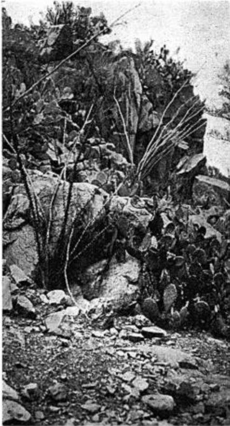
Fig. 4. CHARACTERISTIC VEGETATION ON THE SOUTH-FACING SLOPE OF STONE CABIN CANYON—OCOTILLO, GREEN PAD CACTUS, AND THE SLANTING STALK OF A CENTURY PLANT.

of the mountains from 6,000 to 9,000 feet. A few Canadian zone aspens were found by Mr. Bailey on a cold northeast slope at 9,000 feet.