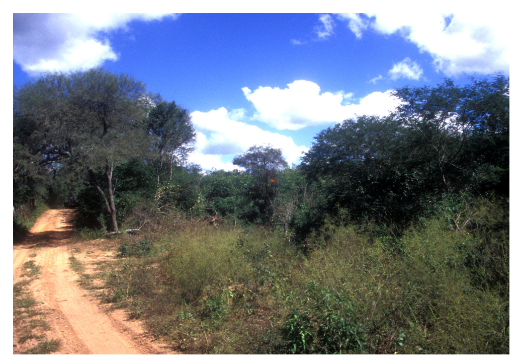
FIG. 2. Lowland chaco forest on the clay-rich soils along the road around Laguna Kaucaya. Photograph by R. T. Brumfield (April/May 2002).

most common genera of herbaceous plants were Lantana (Verbenaceae), Croton (Euphorbiaceae), Euphorbia (Euphorbiaceae), Vernonia (Asteraceae), and Gymnocalycium (Cactaceae). The vegetation alongside the roads and trails was composed of small pioneer trees and bushes of Senna spectabilis (Fabaceae), S. occidentalis, Pterogyne nitens (Mimosaceae), Cestrum spp., Solanum aff. riparium (Solanaceae), and Cleistocactus baumannii (Cactaceae).