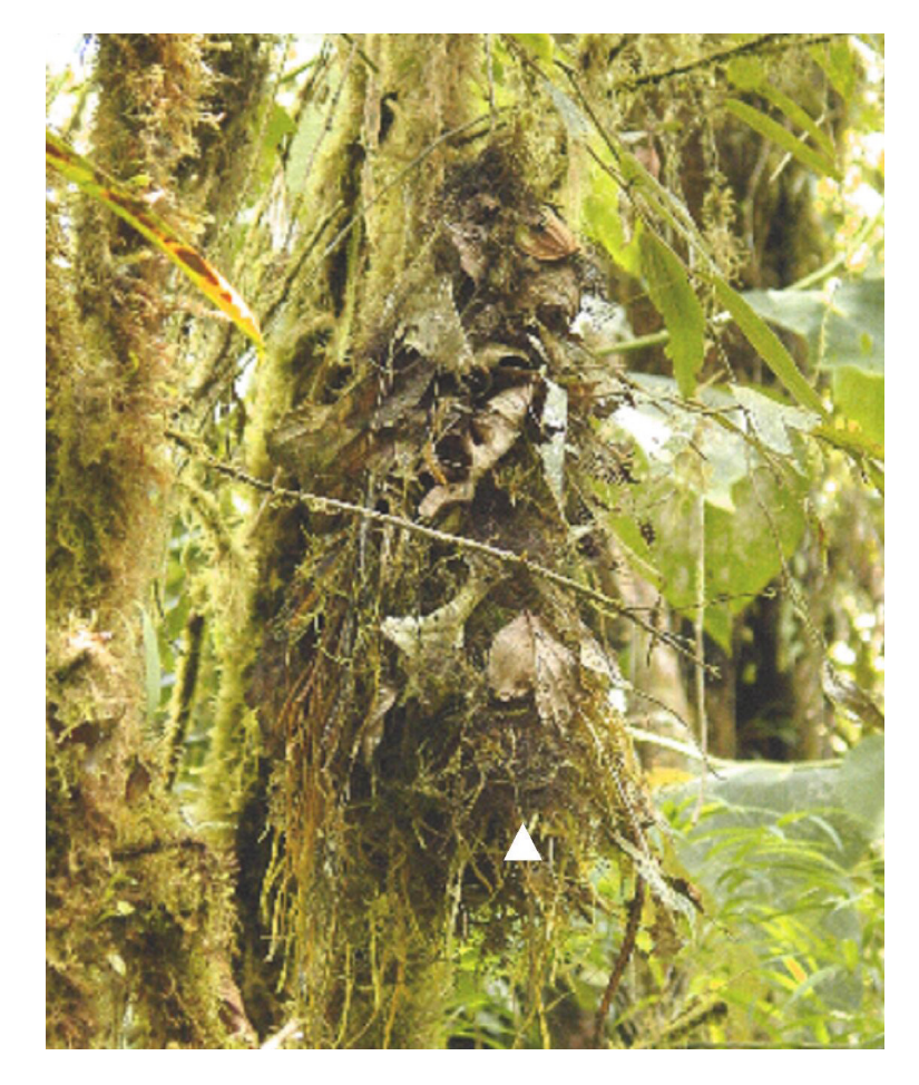
FIG. 1. Nest of the Fulvous-breasted Flatbill with downward opening entrance indicated by the white triangle.

vation, and is an often overlooked, quiet member of mixed species flocks. Almost nothing is known of the breeding of this species. Parker & Parker (1982) give a brief description of the nest and eggs indicating similarities with other species in the genus. Sclater & Salvin (1879) describe the eggs as white with a few reddish spots near the large end, and one male in breeding condition was reported in May, in northwestern Colombia (Hilty & Brown 1986).