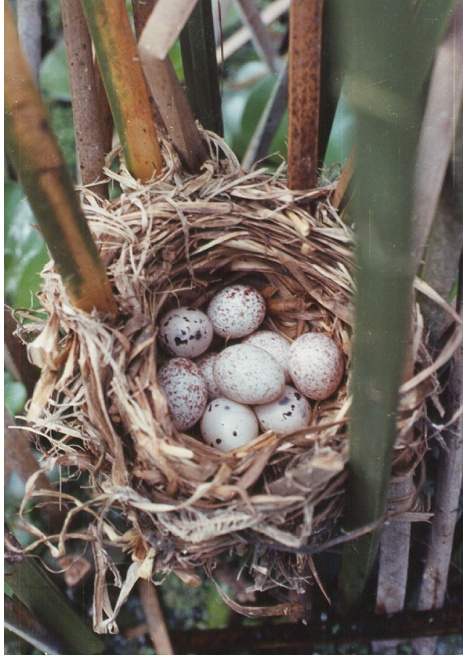
FIG. 2. Nest of Yellow-winged Blackbird ( Agelaius thilius) saturated with Shiny Cowbird eggs, a phenomenon commonly observed in A. thilius nests.