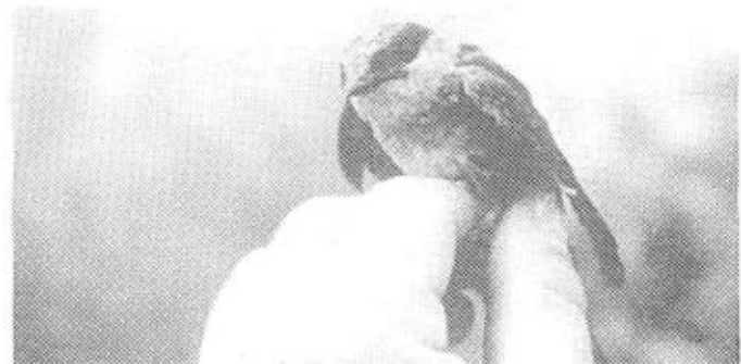
Cave Swallow. 930-92923. AHY-M. Banded 8 July 1983.