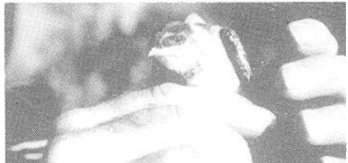
Cave Swallow. 930-92917. L-U. Banded 6 July 1983.

5111 Soledad Primera, Tucson, Arizona 85718