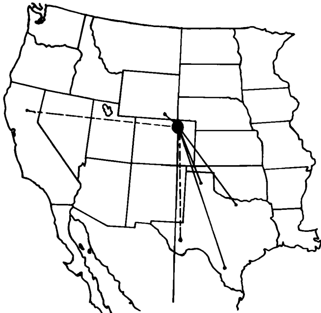
Figure 3. Recoveries of Ferruginous Hawks banded as nestlings in northeastern Colorado, 1973-76. Solid lines indicate direct recoveries. Dashed lines indicate indirect recoveries. Age in years is shown at point of indirect recovery. Recoveries of a 4.6-year and a 1.5-month old occurred 5 km and 21 km respectively from the banding/nest site and are not shown.