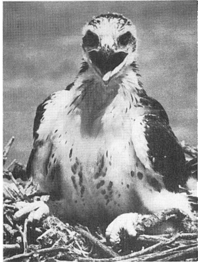
Figure 2. Nestling Ferruginous Hawk just after banding.