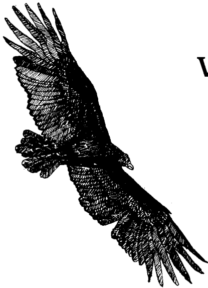
Logo sketch by Barb Petorak