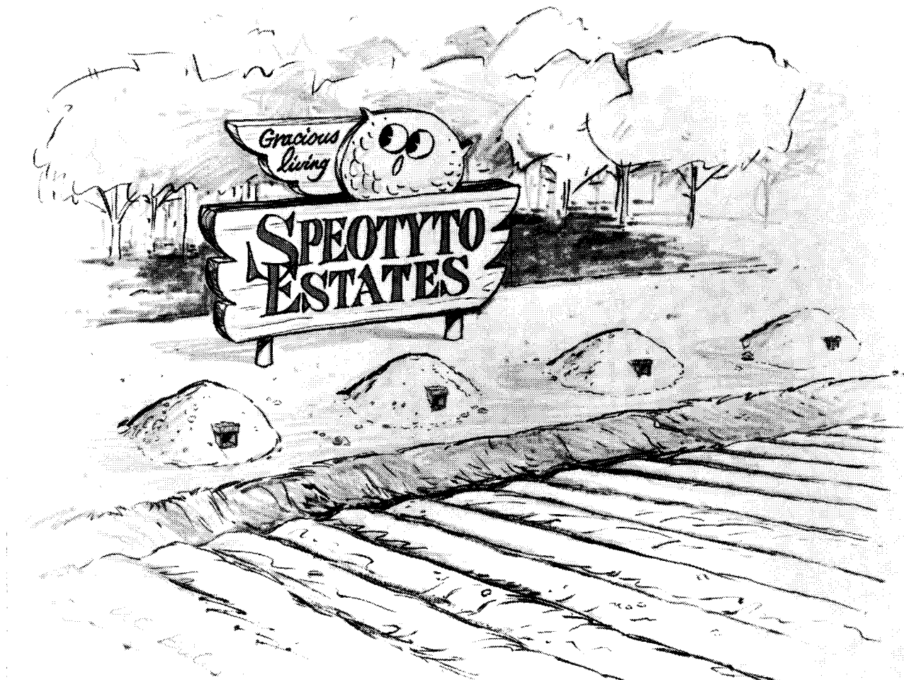
Figure 2. Burrowing Owl "Planned Community"

young in the nest chamber. After banding, the young were replaced and the tunnel similarly repaired with boards. Again, there was no observed desertion by the adult owls. The natural progression from this was to construct a completely artificial tunnel and nest chamber which could be opened for detailed observation of the development of the young.