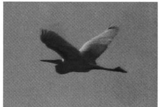
This lucky shot substantiates the first northern (and Arctic Coast) Alaska record of Great Egret, seen near Barrow on 16 June 2007.