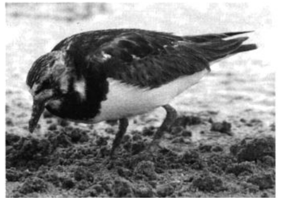
This Ruddy Turnstone, a species casual in Arizona, was present at Willcox 22 (here 30) July through 1 August 2007.