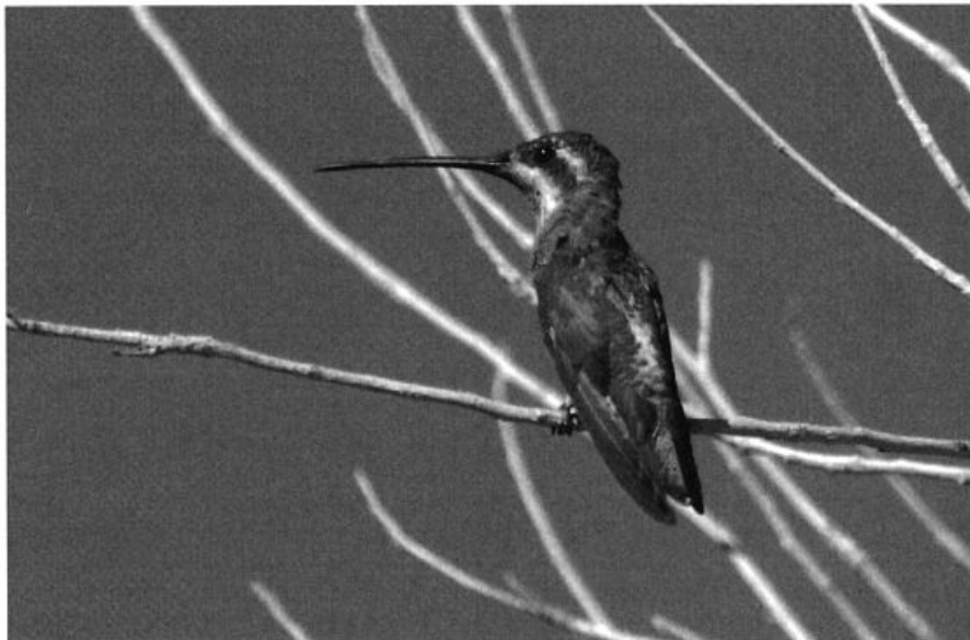
This Plain-capped Starthroat present in Tucson, Arizona 6-26 (here 9) June 2007 was one of the farthest north ever reported in the state, apart from the second state record, which was in Phoenix in 1978.