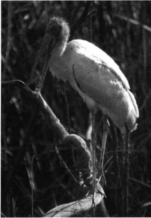
Five juvenile Wood Storks were located at Mittry Lake near Yuma 16 June 2007 (here); the species is considered casual in Arizona, mostly in summer.

(MK et al.). Seldom found n. of Flagstaff, a Whip-poor-will heard near Mangum Spring on the Kaibab Plateau 31 Jul (Z. Zdinak) was perhaps the northernmost individual ever detected in Arizona.