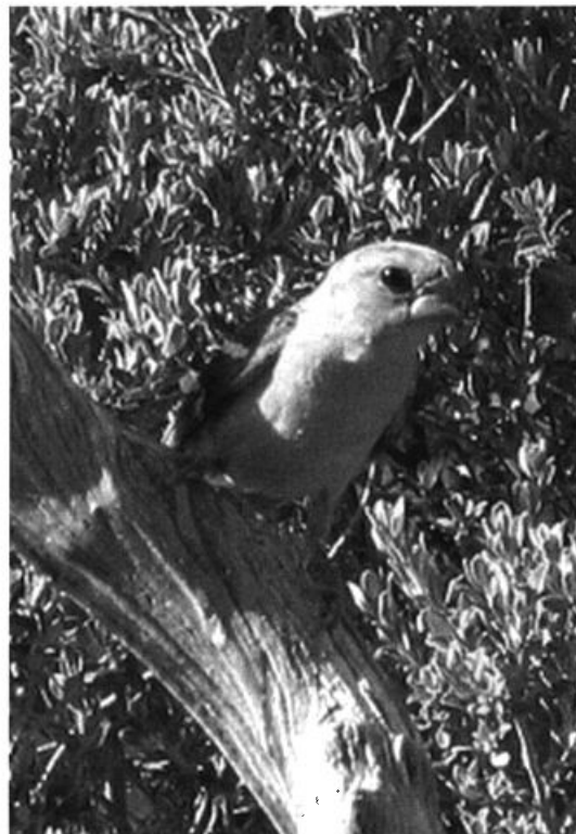
This Yellow Grosbeak in Ash Canyon, Arizona 1 (here) and 2 June 2007 was, amazingly, in the same yard frequented by an Aztec Thrush in 2006!

Thirty or more Band-tailed Pigeons were at atypically low elevations in Portal 16-25 Jun and in nearby lower Cave Cr. into Jul (EH). Interrupting the recent explosion of sightings, just 2 Ruddy Ground-Doves were reported, at Cascabel 12 Jul (MA) and s. of Amado 26 Jul (MB). Whiskered Screech-Owls are known from the New Mexico portions of the Peloncillo Mts. but not so from the Arizona side,