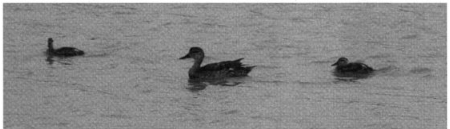
Above-average rainfall made for abundant nesting habitat for waterfowl in the Panhandle, which resulted in nesting records of several species of ducks that are generally considered rare breeders in Texas. This female Gadwall with a total of nine ducklings (here 13 July 2007) represents only about the tenth documented breeding record of the species in the state. Other successful nesting attempts by this species were noted during the period.

Two birds were in the running for the bird of the season—a Snail Kite near Port Isabel and a Common Redpoll on Bolivar Peninsula. The kite was just the third to be documented in the state, but who can explain the third summer record of Common Redpoll from Texas—or why all of them have been from coastal locations? Another surprising record was a Chuck-will's-widow, a first for the Trans-Pecos, which spent much of the period in the Davis Mountains.