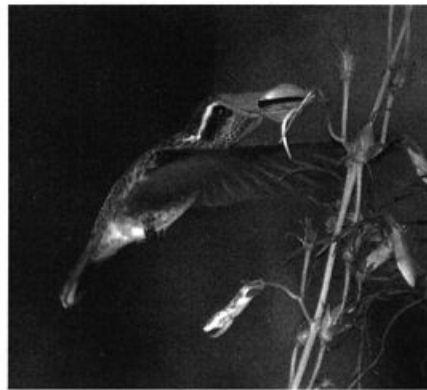
The status of White-eared Hummingbird in Texas has taken an interesting turn in the past three years. Summer 2007 saw another "invasion" of sorts into the Trans-Pecos and raised speculation that this movement could be part of a normal (or developing) post-breeding dispersal. This hatch-year bird (here 5 July) was one of at least six present in the Davis Mountains during the period.

An Osprey near Abernathy, Hale 10 Jun (GB) was only the 3rd Jun report ever for the South Plains. Swallow-tailed Kites are establishing themselves more firmly on the Upper