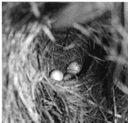
Hybrid Colima Warbler x Virginia's Warblers are known in the upper elevations of the Davis Mountains of far western Texas. This nest, the first known for this combination, was found 13 June 2007 in a secluded canyon in closed-canopy Ponderosa Pine–Silverleaf Oak woodland.