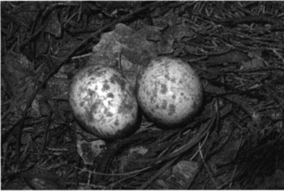
Chuck-will's-widows have been known to occur in Donley County in the eastern Panhandle of Texas for quite some time, but it was only in 2007 that nesting was finally documented. This nest (here 28 April) was located in the spring, and the young successfully fledged in the early summer.

Pied-billed Grebes nested at Granger L., Williamson, with an ad. on an active nest 28 Jun and a juv. present 16 Jul (TFe), and at Fort Stockton, Pecos, where three pairs with young were seen 21 Jul (ML). Masked Boobies seen from shore included an imm. along South Padre I., Cameron 5 Jul (BMc), one reported diving off of Follett's I., Brazoria 18 Jul (JSt), and another at Boca Chica, Cameron 29 Jul (ScC). Northern Gannets were reported all along the coast in impressive numbers during the period. Reflecting this unusual number of summering birds was the number of individuals recovered along the beaches. Three gannets were found beached 20 Jul on the Bolivar Pen., Galveston (JKe), and many dead or moribund birds were found in Nueces, Kleberg, and Kenedy (DN, BS) during the period. An amazing total of 34 beached birds was reported as of 18 Jul to the ARK rehabilitation center in Port Aransas, Nueces (TA). Interestingly, most of these were second-year birds.