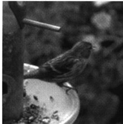
Nothing short of bizarre, this Common Redpoll on the Bolivar Peninsula, Galveston County, Texas on 13 June 2007 provided the third summer record for the state. Astonishingly, all of these records have come from coastal locations.