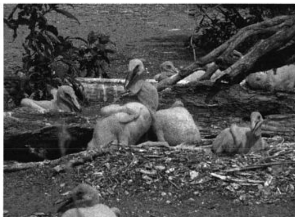
These young American White Pelicans in colony on a spoil island in Clinton County, Iowa 13 June 2007 mark the first successful nesting by the species in the state.