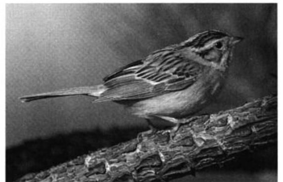
One of Pennsylvania's rarest summer residents, this Clay-colored Sparrow was photographed at Piney Tract, Clarion County on 23 June 2007.