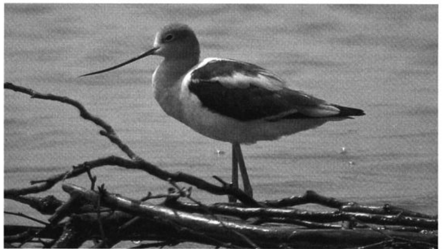
Very rare in western Pennsylvania away from Lake Erie, this American Avocet at Etna, Allegheny County on 29 July 2007 furnished was just the second county record.