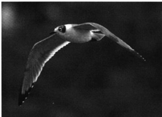
This first-summer Franklin's Gull was photographed 10 June 2007 at productive Conejohela Flates, Washington Boro, Lancaster County, Pennsylvania.