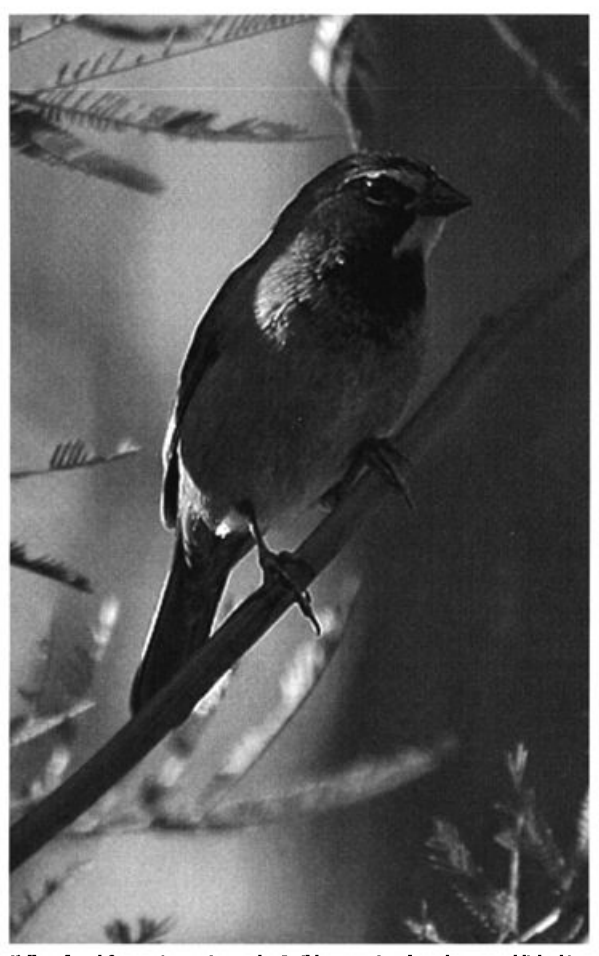
Yellow-faced Grassquits, native to the Caribbean region, have been established in the Koʻolau mountains of Oʻahu Island for several decades but had not been found elsewhere on the island until Eric VanderWerf discovered some in the Waianae Mountains of southwestern Oʻahu Island in early (here 15) May 2007.

lapanese Bush-Warblers were heard calling