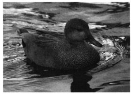
Among the waterfowl that lingered well into the spring of 2007 was this drake Gadwall photographed at Waiakea Pond on the Big Island of Hawai'î on 8 April. Gadwall is rare in the Hawaiian Islands region, and most Gadwalls that are discovered are too shy to be photographed well. This bird was in a pond where resident ducks and geese are frequently fed and was much tamer than the usual migrant ducks in the region.

Two Short-tailed Albatrosses (Endangered) were observed on Midway. An ad. frequented Sand I. near a group of decoys Oct 2006–7 Mar, while an imm. was seen mainly on Eastern I. Oct through at least 7 Mar (JK). Single Red-billed Tropicbirds were observed on Nihoa I. 24 Mar (IJ, CR, CS) and in Waimanalo O. 2 (EV, LY) & 10 Apr (MW). Two Red-billeds were observed in Waimanalo 1-4 Apr (EV, LY). Red-billeds are rare in the Region but have been reported fairly regularly in the