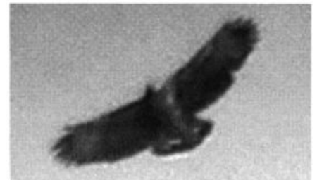
This immature Solitary Eagle was identifiably photographed near Alta Cima, Tamaulipas on 14 March 2007; the species is quite rare in the state.