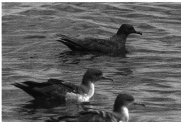
Two Christmas Shearwaters, including this bird (at rear) swimming with Wedge-tailed Shearwaters, were seen 8-10 kilometers off Puerto Angel, Oaxaca, Mexico on 8 March 2007. This photograph furnishes rare documentation of the species for the state and for the country.

A Brown-crested flycatcher was recorded at Cañón de Fernández S.P. on the Nazas R. 1 May (RLL, FVP). Three Great Crested Flycatchers encountered 20 May in Xalapa were late migrants (AM). An Eastern Phoebe near Colonia Mina Bismark 3 Mar was w. of normal range (AM, JM). A pair of Black-crowned Tityras was observed nesting at La Florida below Gómez Farías, Tamps. 4 Apr (WC). A Black-capped Vireo was seen in Bosque Venustiano Carranza 8 Apr (WB, FVP), and a Yellow-green Vireo was at Los Pavos Canyon, Son. 11 Apr (PW, NM-C). A Bell's Vireo was at Laguna Rodeo, Mor. 22 Feb (MDC). A Black-throated Magpie-Jay was seen in Cañon del Realito being mobbed by 2 Northern Mockingbirds 15