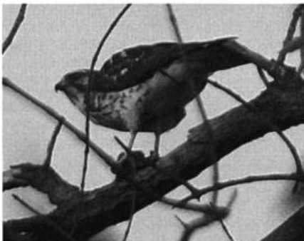
Another raptor of interest at Bosque Venustiano Carranza, Torreón, Coahuila was this Gray Hawk, photographed 8 April 2007.

Although reports were scarce this spring, it is obvious that a migration of warblers and seedeaters entered the central and southern coasts of Quintana Roo 22-24 April, during a period of strong southeasterly winds. We are beginning to understand spring migration routes more clearly; Barn Swallows, for instance, move toward Cuba from Yucatan's north coast, whereas many flycatchers and orioles appear to transit the southern portion of the peninsula, perhaps in order to take an overland route back north or shortening the trip across the Gulf of Mexico.