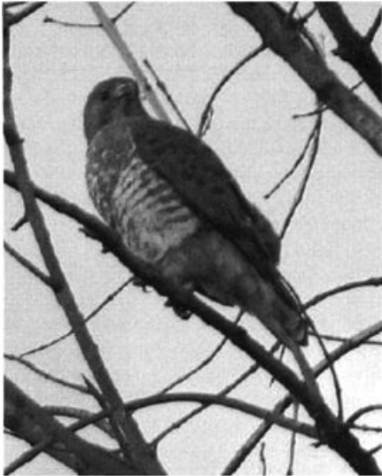
This adult Broad-winged Hawk was found at Bosque Venustiano Carranza, Torreón, Coahuila 15 April 2007.