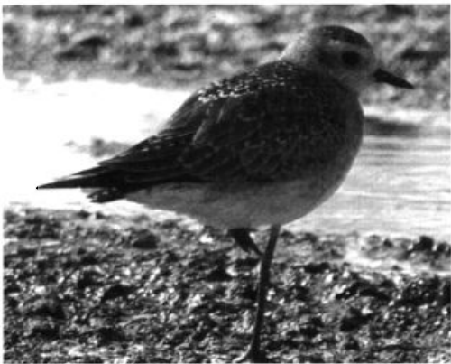
Like most American Golden-Plovers recorded in the Baja California Peninsula region, this cooperative individual was in southern Baja California Sur, where it was one of two at Lagunas de Chametla 28-29 (here 28) March 2007.

tos 13 Mar (MJI). Only 4 Vaux's Swifts were seen at E.S.J. this year (24 Mar; SGM), where up to 20 wintered the year before. Rufous Hummingbirds were reported from Bahía de