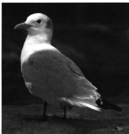
Generally rare in Mexican waters, this adult Black-legged Kittiwake was on Baja California's Islas Los Coronados 20 March 2007.