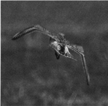
This Baird's Sandpiper was in Imperial Beach, San Diego County, California on the exceptionally early date of 11 March 2007.