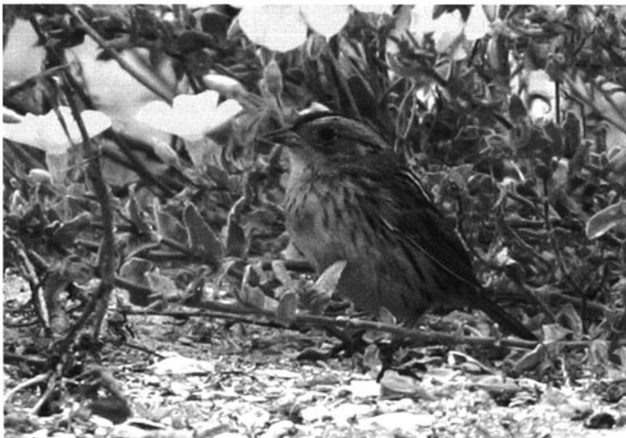
This lost Nelson's Sharp-tailed Sparrow at Mission Bay in San Diego, San Diego County, California on 20 May 2007 was away from the salt marshes the species inhabits in winter and was found on an exceptionally late date.