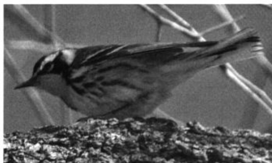
Still a rarity in California, this Yellow-throated Warbler stopped on 6 May 2007 at a small desert oasis near the Hayfield Pumping Station, Riverside County.