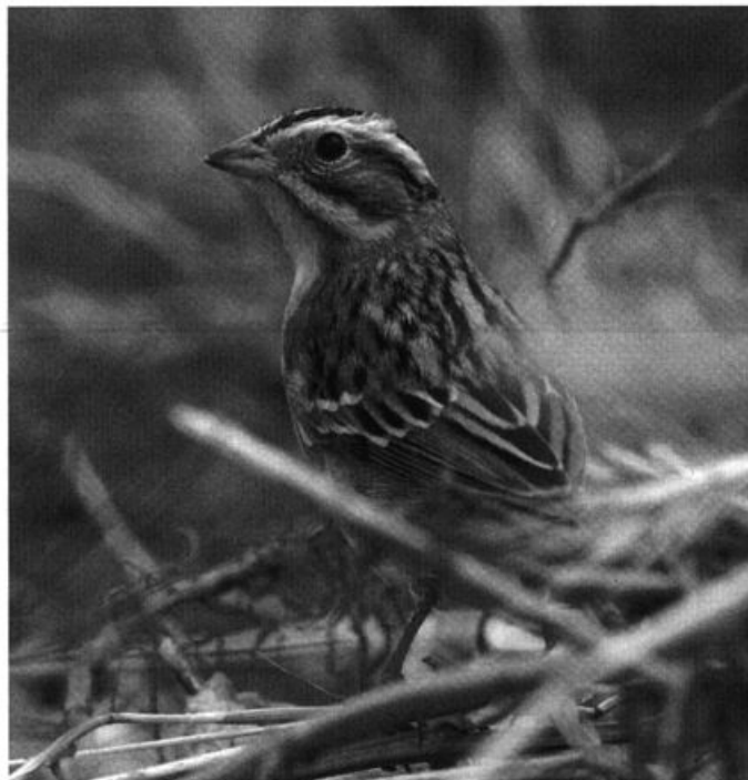
Although Clay-colored Sparrows are rare but regular fall migrants and winter visitors to California, few are found in spring, so this one in the Tijuana River Valley, San Diego County 15 May 2007 was unexpected.

deserts, including Inyo's earliest ever at China Ranch 21 Apr (JEP). The only Chestnut-sided Warblers were at Sage Flat Rd. s. of Olancho, Inyo 1 Jun (C&LL), G.H.P. 3 Jun (TEW, LLA), and Baker, San Bernardino 5 Jun (AEK). Magnolia Warblers were at Montana de Oro 26 May (JSR) and San Clemente I. 30 May (JEB) and inland at Bishop 23 May (J&DP) and