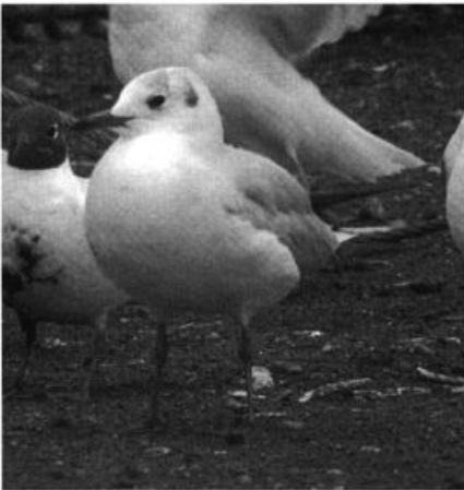
This first-cycle Black-headed Gull was with migrant Bonaparte's Gulls in Goleta, Santa Barbara County, California on 20 April 2007.

The only Little Blue Heron found away from coastal San Diego was an ad. at Hansen Dam, Los Angeles 9 May (KLG). A Tricolored