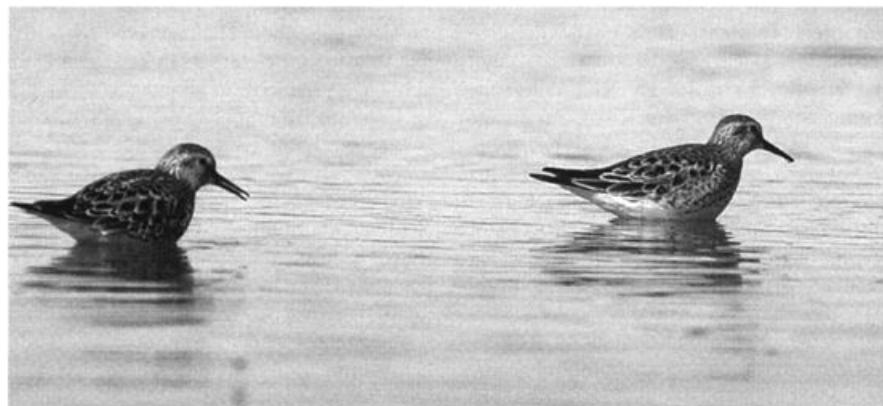
These two White-rumped Sandpipers at the China Lake Naval Air Weapons Station, Kern County, California 23 May 2007 were, remarkably, the third and fourth to be found at this location.