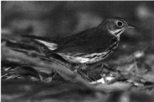
A few Ovenbirds are found in the eastern half of the Southern California region each spring, with this one in El Centro, Imperial County found on 16 May 2007.

Clemente I. 19 May (MRS) and Zzyzx 27 May (MT); another at Twentynine Palms 6 May+ (DE) was eventually seen constructing a nest, perhaps paired with one of the local Western Kingbirds.