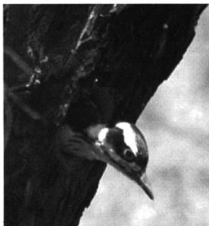
This young male Hairy Woodpecker, with its head protruding from a nest cavity in Bakersfield, Kern County, California on 20 April 2007, provides the first documentation of the species breeding in the San Joaquin Valley.

ing 18 near Lancaster, Los Angeles 18 May (MSanM) and 20 at Owens L., Inyo at the end of the period (SLS), and an additional 8 were along the coast. An ad. Little Gull, rare in California, was at Playa del Rey 3 Mar (KGL). A first-cycle Black-headed Gull in Goleta 20 Apr (WTF) was the 9th to be found in S. California but the 5th in Santa Barbara. Inland, an ad. Heermann's Gull was associating with nesting Caspian Terns at S.E.S.S. 19 Mar+ (GMcC), and a first-cycle Lesser Black-backed Gull remained at S.E.S.S. 8-25 Apr (GMcC), establishing the latest date for this species in California. At least 7 Glaucous Gulls were along the coast, with the latest being one in Oxnard, Ventura 16 May (RS), and another was inland at S.E.S.S. 17-25 Apr (KLG). A Sabine's Gull was on the coast in San Diego 15 Apr (MS), and over 1000 were encountered to the w.-sw. of San Nicolas I. 21 Apr (JSF). Three Elegant Terns,