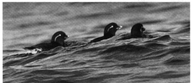
Seven Parakeet Auklets were encountered about 73 kilometers west-southwest of San Nicolas Island during the Los Angeles Audubon Society's 21 April 2007 pelagic boat trip to deep waters off Southern California.