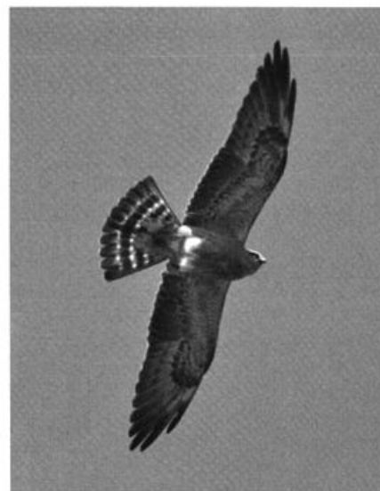
The strongly banded tail shows well on this first-summer Mississippi Kite, photographed on the second day of its 26 May through 4 June 2007 stay at the South Coast Botanical Garden on the Palos Verdes Peninsula, Los Angeles County, California.

The only Fulvous Whistling-Duck was one at S.E.S.S. 17 Apr (KLG) and 1 Jun (GMcC). About 25 Greater White-fronted Geese flying northward off Malibu, Los Angeles 27 May (DSC) were exceptionally late for migrants. A flock of 43 Brant in El Monte, Los Angeles 29 Apr (MCL) was along the presumed "path" followed by this species when migrating from the Gulf of California through the Salton Sink to the Pacific Coast each spring; a single bird at Owens L., Inyo 18 Mar (SLS) was the only one reported inland away from this "path." A wintering Eurasian Wigeon in Goleta, Santa Barbara remained through the late date of 20 Apr (JMG). Single male Eurasian Teal were in Goleta 17 Mar (NAL) and Los Osos, San Luis Obispo 3 Mar–8 Apr (TME). A Harlequin Duck at Cayucos, San Luis Obispo 8–17 May (TME) was the only one reported. Seventeen Surf Scoters on Klondike L. near Big Pine, Inyo, along with 5 more on nearby Tinemaha Res. 20 Apr (T&JH), was an amazing number for this area; elsewhere inland, away from the Salton Sea, one was at Owens L., Inyo 12 May–3 Jun (SLS), and 2 were in Baker, San Bernardino 20 Apr (JEP). Two White-winged Scoters on the Salton Sea at North Shore, Riverside 19 Apr (BMi) were inland; a flock of 35 on Morro Bay, San Luis Obispo 24 Mar (TME) was a large number for S. California. The latest of the wintering Black Scoters were 2 at Pt. Mugu, Ventura through 27 Mar (PGR) and one at San Simeon 2 Jun (MLS). A Long-tailed Duck at S.E.S.S. 8 May–13 Jun (EM)