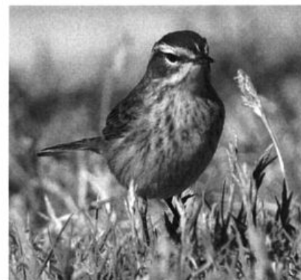
Vagrant Palm Warblers are more numerous on the coast than inland in California, especially in spring, so this one at Morongo Valley, San Bernardino County on 6 May 2007 came as a surprise.