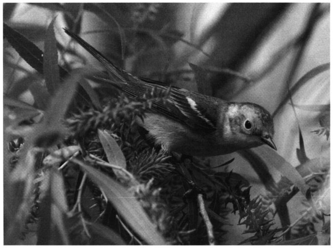
Hermit Warblers are always a treat in Texas away from the Trans-Pecos. This female at Port Aransas, Nueces County 21 April 2007 provided a rare Costal Bend Record but was the second for the county.

for the Panhandle. A Cave Swallow in Kent 15 Mar (AHe) was the earliest recorded for the South Plains, while one in ne. Texas 31 Mar (PB) provided a Smith first. A Barn Swallow at L. Tanglewood, Randall 25 Mar (TJ) was early for the Panhandle.