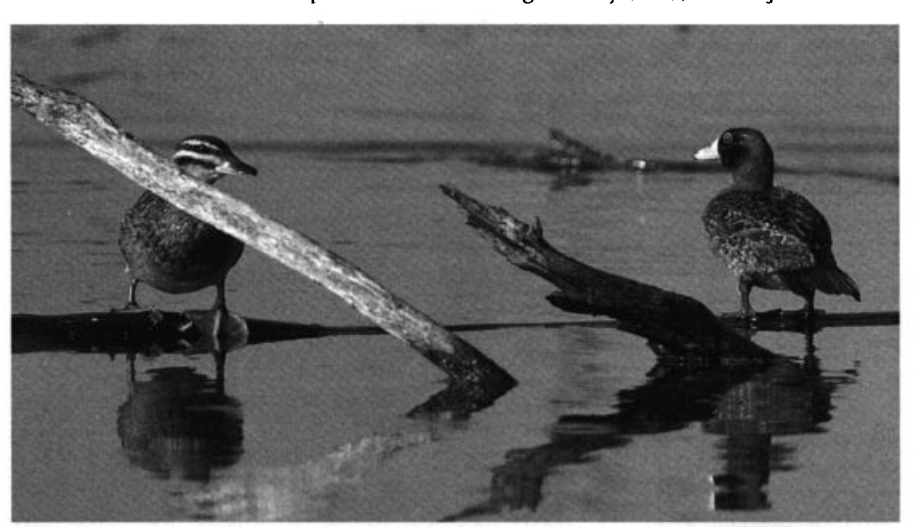
What could be called a mini-invasion of Masked Ducks occurred in Kleberg County, Texas, when birds were found at three different locations between 2 April and 30 May 2007. This pair was the most cooperative during its stay near Riviera from 11 May through the season (here 20 May).

Almost an annual visitor to the El Paso area, 2 Brown Pelicans were at McNary Res., Hudspeth 5 May (JPa), with one remaining through 12 May (MSt); another juv. was at the