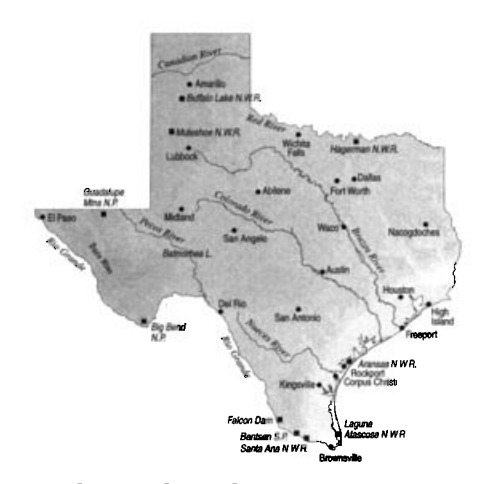
Mark W. Lockwood Eric Carpenter Willie Sekula

or much of Texas, the spring of 2007 was characterized by above-average precipitation and below-average temperatures. Of course, there were exceptions to this, but they were rather hard to find in the big picture. In the far west, El Paso received more than double its normal rainfall through May, with 92.4 mm vs. 43.4 mm. The Chisos Basin of Big Bend National Park reported 191.2 mm of precipitation during the season, up 142.7 mm from 2006. The Panhandle and South Plains received larger quantities of rain through the period, filling all of the playas to the point that some observers commented that there was too much water. This trend continued farther east, as much of north-central Texas received over 130 mm of rain above normal, resulting in levels in reservoirs raising as much as 3.7 m. On the Upper Coast, Houston received 511.5 mm of rain or 204.7 mm above normal.