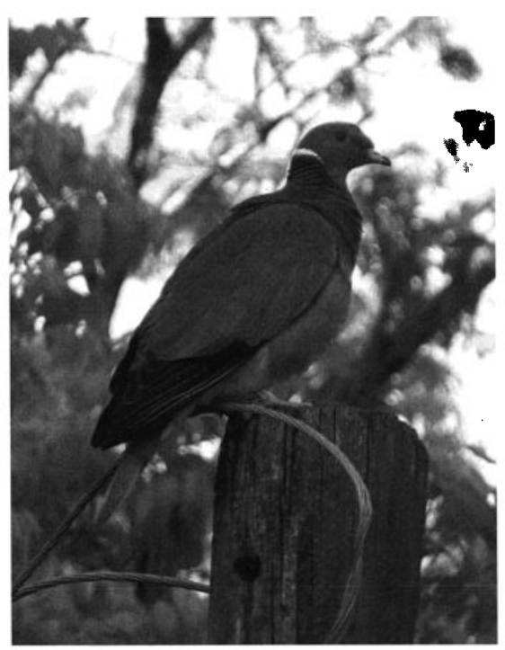
Providing the third record for the Upper Texas Coast, this Band-tailed Pigeon made a brief appearance at Houston, Harris County 12 April 2007.

Neotropic and Double-crested Cormorants or among Snowy and Cattle Egrets. Continuing a trend of lingering and possibly breeding American Bitterns along the coast, at least one bird was still present at San Bernard N.W.R., Brazoria 27 May (JSt). Unusual in the South Plains, an early Snowy Egret was at White River L., Crosby 24 Mar (AHe), while another was in Gray 23 Apr (MDL). A Tricolored Heron in Midkiff, Midland 14 Apr (BLu et al.) was unusual, as was one in Rio Grande Village, Brewster 7 May (MSt). A Reddish Egret flying over College Station, Brazos 10 May (ER) was a county first. A Glossy Ibis stopped briefly at Temple, Bell 25 Apr (RPi).