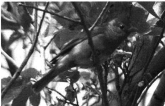
This first-spring male Summer Tanager at Clavet on 31 May was one of two reported in Saskatchewan in spring of 2007. It represents about the fifth sighting for the province.