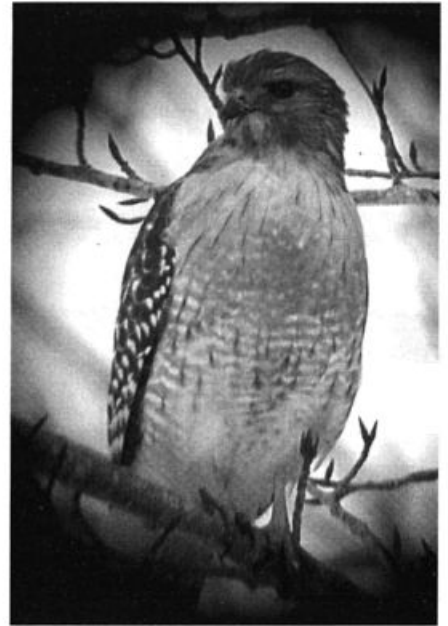
Red-shouldered Hawk is a less-than-annual visitor to Manitoba, so three birds documented in one season was above the norm. This bird was near Whitemouth on 25 March 2007.

noted at Kitsim Res. near Brooks, AB 18 May (JD). Black-necked Stilts made an excellent showing in Alberta, with 300+ estimated altogether (TK); 7 were found between four Saskatchewan locations (m.ob.). A pair at Reed L., SK already had 3 young 31 May, but