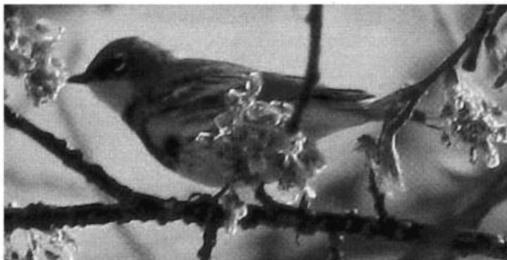
Although there were at least three previous reports of Audubon's Warbler in Manitoba, this bird in Winnipeg on 2 May 2007 was the first one documented photographically.