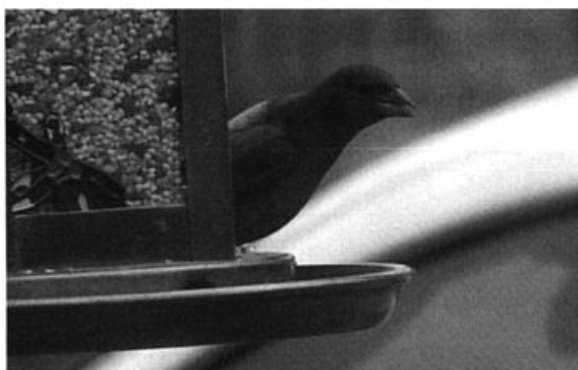
Saskatchewan has hosted several Painted Buntings in recent years, all of them at feeders. This male, the province's fifth, was at Aberdeen on 21 April 2007.