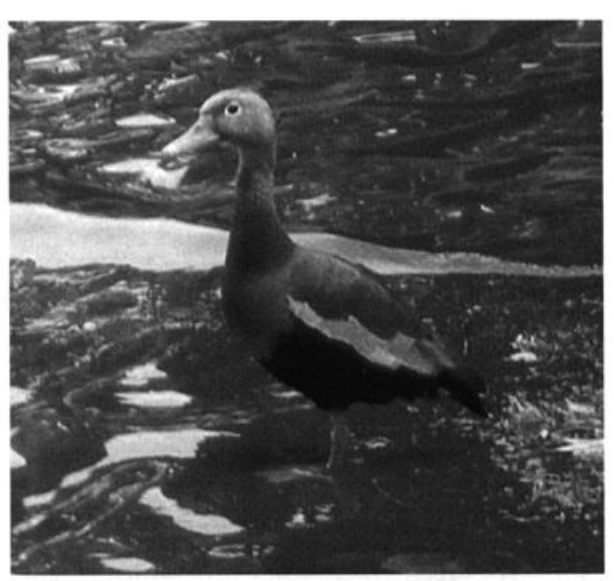
This Black-bellied Whistling-Duck was observed 28 May 2007 and later (here 2 June) along the banks of the Coosa River near Southside, Etowah County. It furnished a fifth documented Alabama record.

ubee (TLS), surpassing the previous late area record by 42 days. The other was even later and rarer on the coast 3 May at Ansley, Hancock, where only a few previous county