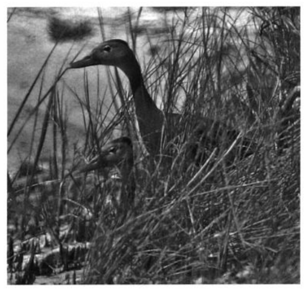
These two Black-bellied Whistling-Ducks discovered 1 May 2007 (here) were a one-day wonder on Dauphin Island, Mobile County. They provided only the fourth documented Alabama record for this expanding species and the first on the coast. All previously accepted records were from the Tennessee Valley.

server on a boat trip near Isle aux Herbes and Cat I., s. of mainland Mobile, AL, was therefore very surprised to find a male Surf (ph.), a White-winged, and a female Black Scoter,