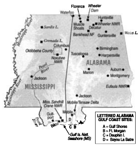
GULF OF MEXICO