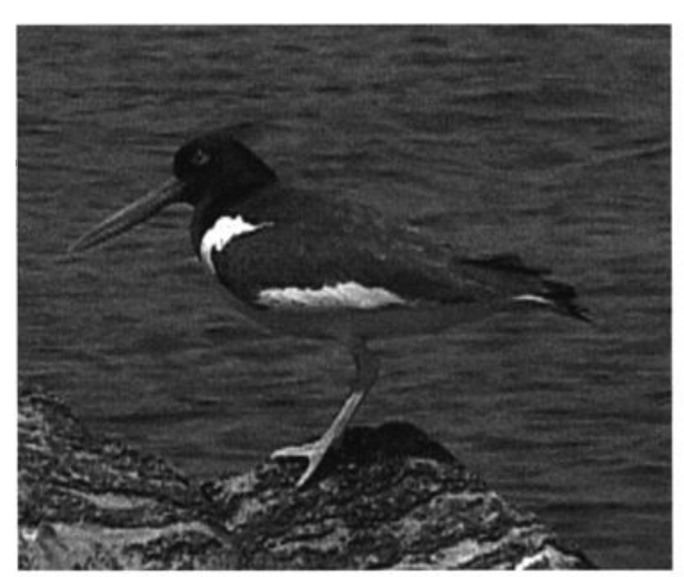
This American Oystercatcher on rocks in the Tennessee River near Sheffield was documented 24 May 2007 by two alert fishermen. This Colbert County location—550 km from the Gulf of Mexico—was amazing for this strictly coastal species and represents not only the first inland Alabama record but also one of only a few documented in interior North America.