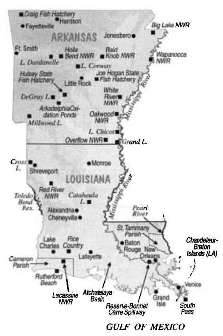
Steven W. Cardiff

Passage of a strong cold front through the region 3-5 April allowed a cold air mass to penetrate unusually far south, resulting in a late freeze affecting the Ozarks region