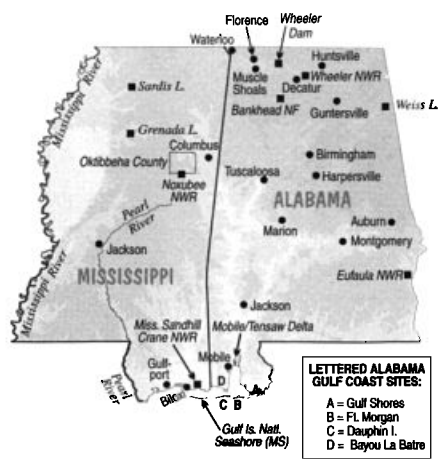
GULF OF MEXICO