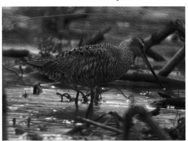
This female Hudsonian Godwit was one of two found in western Henderson County, Kentucky 25 April 2007.