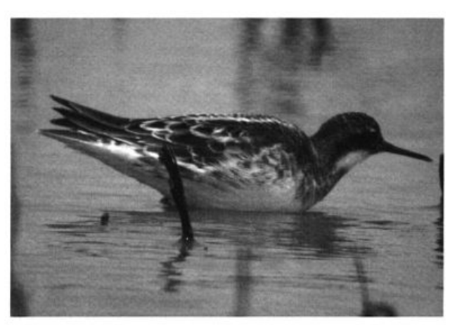
This Red-necked Phalarope was present in western Henderson County, Kentucky 23 May 2007.