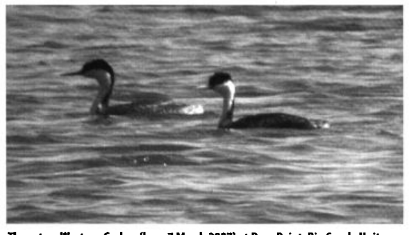
These two Western Grebes (here 7 March 2007) at Pace Point, Big Sandy Unit, Tennessee National Wildlife Refuge, Henry County, Tennessee were holdovers from the winter season and may have been the same two present at the same location the previous winter.

Northbound Double-crested Cormorants peaked in late Mar at 15,000 (a new state high count) on L. Barkley, Lyon/Trigg, KY 30 Mar (DR). Three male Anhingas seen soaring over Fulton, KY 7 May (ph. DR) represented an early arrival date for the state and the first record of more than one individual since 1950. One was at Hatchie N.W.R., Haywood, TN 17 May (DPr). One to 3 American Bitterns were reported on eight occasions at five locations in Kentucky 9 Apr-17 May and on nine