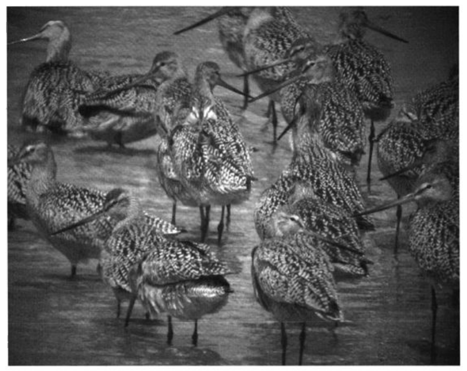
These Marbled Godwits were part of a flock of 37 at Kentucky Dam, Marshall County, Kentucky 19 April 2007; the flock represented a new state high count. A green band on the leg of one bird indicated that it had been banded on the coast of Georgia.

Barkley, Lyon, KY 31 Mar-13 Apr (BY, MY, †BPa et al.). Approximately 1500 Bonaparte's Gulls were still on L. Barkley, Lyon, KY 30 Mar