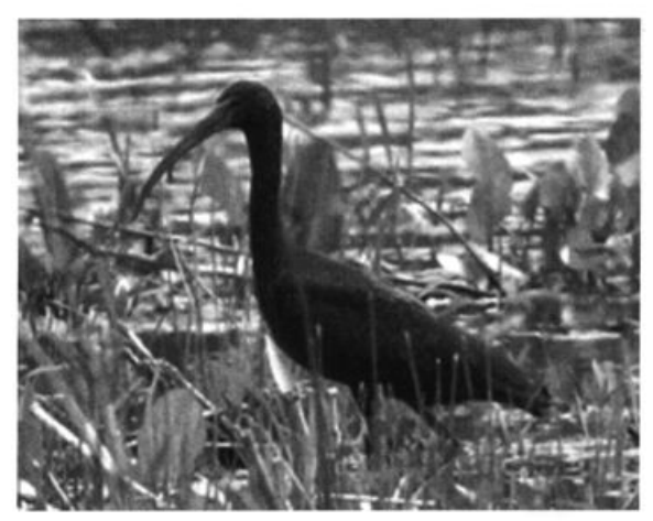
At least three Glossy Ibis put in appearances in Kentucky in spring 2007; this individual was found in Fulton County 3 May.