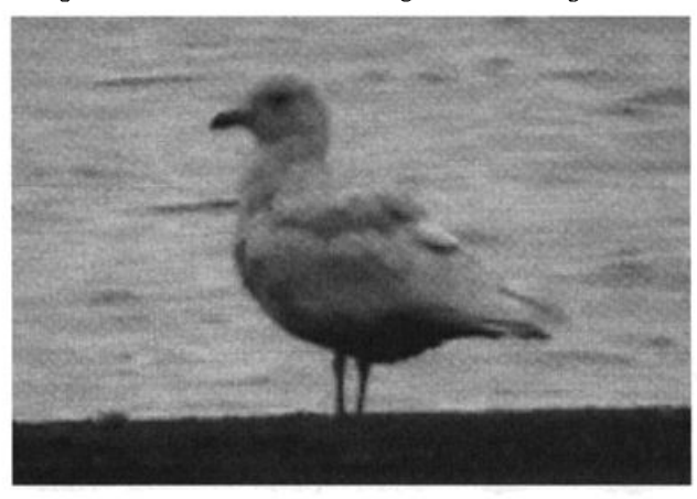
This first- or second-cycle Iceland Gull was present on Lake Barkley, Lyon County, Kentucky 28 March 2007.