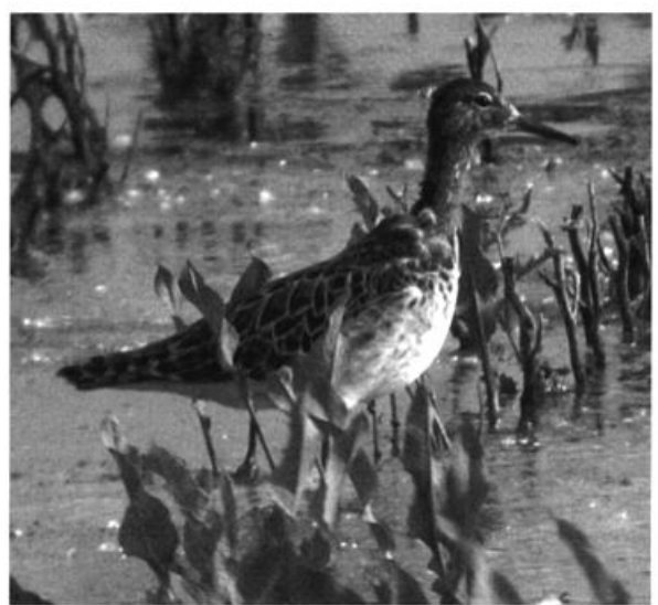
This Ruff was present in Lake County, Tennessee 27 April (here) through 1 May 2007. The species has been of nearly annual occurrence in the Tennessee & Kentucky region during the past decade.

of Barn Owl in Kentucky: one in Pulaski (RD); one at a previous year's nest site in Henry 4 Apr (BPa); a family of 5 young in Flem-