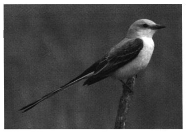
This female Scissor-tailed Flycatcher was a one-day wonder on 7 May 2007 at Cottonwood Recreation Area below Saylorville dam, Polk County, Iowa.

Apr-22 May made for a good spring showing. An unusual flurry of Western Sandpiper sightings included three Missouri reports 2-24 May and three lowa reports 22-25 May. These reports are later than expected when compared to historical reports and indicate a need for careful documentation of all spring reports of this species in the Region. Two Iowa Buff-breasted Sandpipers reports 15-17 May highlight the migration timing for this rare spring migrant. The only Red-necked Phalaropes were in Woodbury, IA: 7 (POR) & 19-20 May (SJD, JG, m.ob.). Many shorebirds arrived early this spring. Notable records included a record-early Piping Plover 8 Apr in Harrison, IA (Jonas Grundman), Upland Sandpipers on 17 Mar in Dunklin, MO (†Bill Reeves) and 2 Apr in Decatur, IA (NJM), 3 Dunlins on 1 Apr in Greene, IA (SID, AB), and a record-early Wilson's Phalarope 24 Mar at B.K. Leach C.A., Lincoln, MO (DR, Tom Bormann).