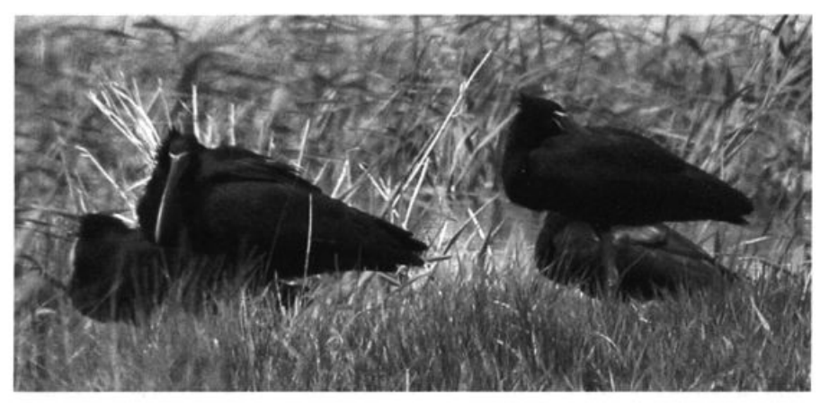
These Glossy Ibis were part of a remarkable flock of seven discovered 7 May 2007 at Moeckley Prairie, Polk County, Iowa.