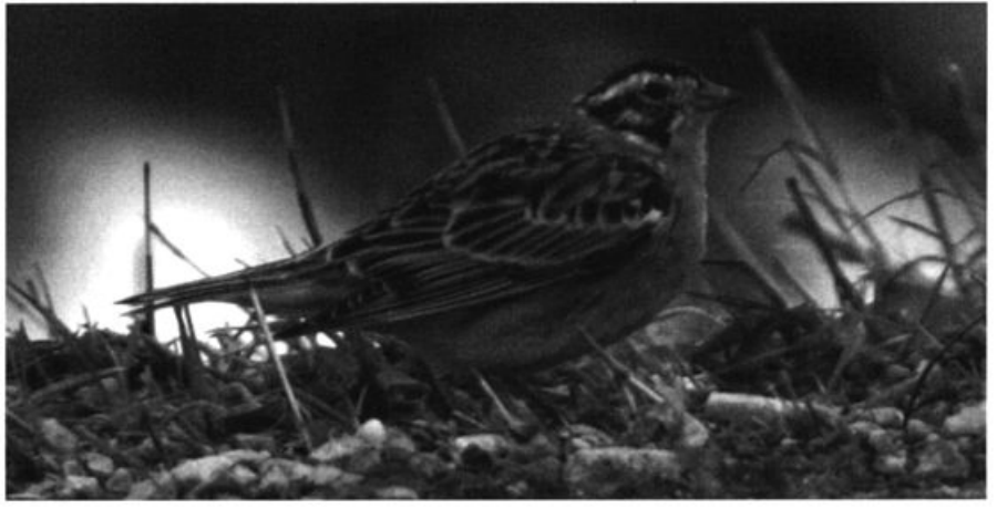
An 11 April 2007 snowstorm grounded many longspurs in northern lowa, including this male Smith's Longspur in Hamilton County.