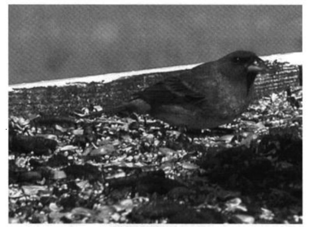
This male Indigo Bunting x Lazuli Bunting hybrid photographed 9 May 2007 at Fairfax, Atchison County was only the second report ever of this hybrid in Missouri.