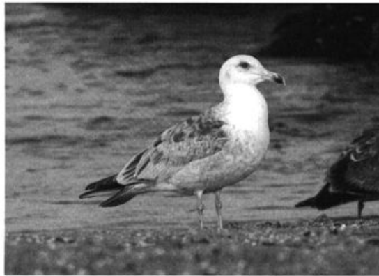
This second-cycle Slaty-backed Gull at Point Pinos, Monterey County, California 5 February 2007 was a first for the county.