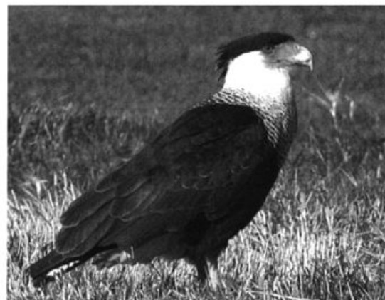
Crested Caracaras wintered in California's coastal Humboldt and Monterey Counties. This adult was seen throughout the season in northern Monterey County, often frequenting the golf course near Point Joe, where this photograph was taken 28 December 2006. On 25 February 2007, it was joined by a first-winter bird at the same location.