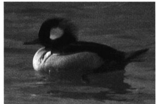
A striking duck, this apparent Bufflehead x Hooded Merganser hybrid was found at the Berkeley Marina, Alameda County, California 8 December 2006 but not reported thereafter.