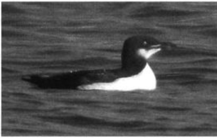
This Thick-billed Murre at Point No Point, Kitsap County, Washington 31 December 2006 through 31 (here 20) January 2007 was one of at least four found in the Oregon & Washington Region this winter. Over 50% of Washington's Thick-billeds have been found in the past five years, perhaps due to increased observer scrutiny.