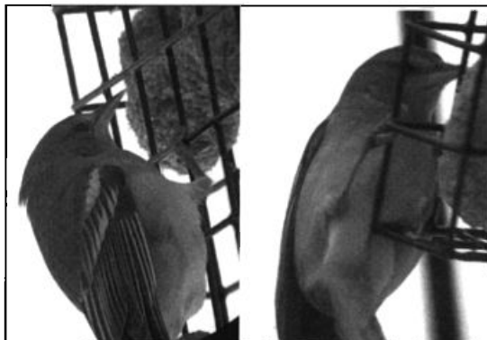
Very rare in winter in British Columbia, this Bullock's Oriole visited a feeder in the Parksville–Qualicum area regularly until 10 (here 1) December 2006.

Nov–10 Dec; it reappeared 10 Jan after a coastal snowstorm (C&DB, ph. GLM). There