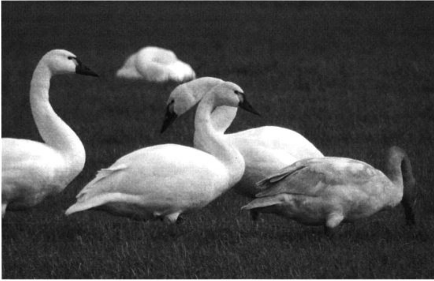
The bills of these adult Tundra Swans near Conway, Skagit County, Washington 20 January 2007 range from 10% to 22% yellow when measured in profile. According to Evans and Sladen (1980; Auk 97: 697-703), this places two of the birds as intermediate between Bewick's (22.9% or more yellow on bill) and Whistling Swan (15.8% or less yellow on bill). The immature in this photograph also appeared intermediate between these subspecies.