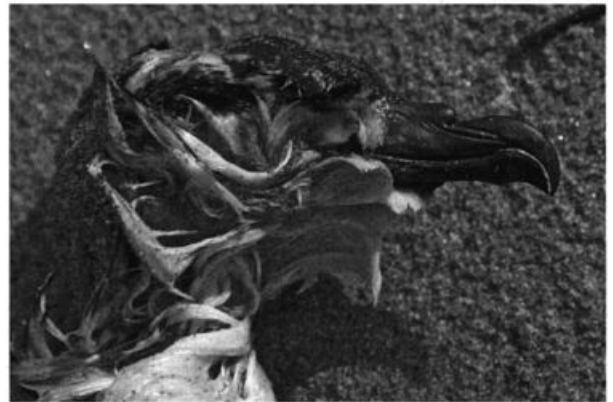
This Mottled Petrel carcass was found on Arcadia Beach, Clatsop County, Oregon 25 February 2007. Most records of this species in the Pacific Northwest involve either live birds far offshore or dead birds on beaches between October and March.

record. A Greater Yellowlegs was at Prineville, Crook 14 Dec (CG); though annual in Washington's Columbia Basin; they are not annual during winter in e. Oregon. Both yellowlegs have become more numerous during winter on the westside. This year, 100 wintered around F.R.R. (DI), up from a norm of about 50 a decade ago. A flock of 58 Greater Yellowlegs (with one Lesser Yellowlegs) at Shillapoo Bottoms, Clark 17 Feb exceeded any previous Washington winter count away from the outer coast and may have been very early migrants (SM). Ten years ago, Lesser Yellowlegs were barely annual in Oregon and essentially unrecorded during winter in Washington. This winter, there were 4 in Oregon, including a maximum of 3 at F.R.R. 5 Jan (DI); singles in Washington appeared at Olympia 17 Dec (KB) and near Centralia, Lewis 18 Dec (B. Shelmerdine). A Willet at the Kennedy Creek Estuary, Mason 1 Dec added to only about eight Washington winter records away from the outer coast (J. Buchanan). A Spotted Sandpiper enlivened Union Gap, Yakima 16 Dec (J. Hebert); now almost annual in e. Washington, this species was recorded only once there prior to 1996. Rare away from the outer coast, 7