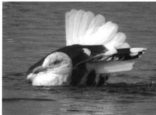
Washington's eleventh Slaty-backed Gull resided at Renton, King County from 25 (here 30) December 2006 through February 2007.