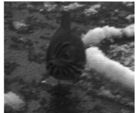
This Ovenbird was present at Medford, Jackson County 16-19 (here 17) January 2007, furnishing Oregon's first and the Oregon & Washington Region's second winter record.