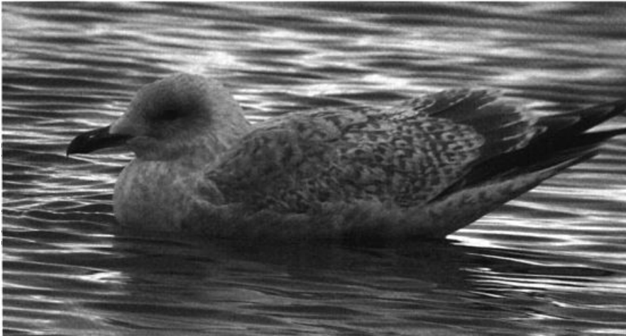
This apparent Vega Herring Gull at Renton, King County 28 December 2006 is the first to be well documented in Washington. In flight, a typical Vega tail and rump pattern were noted.