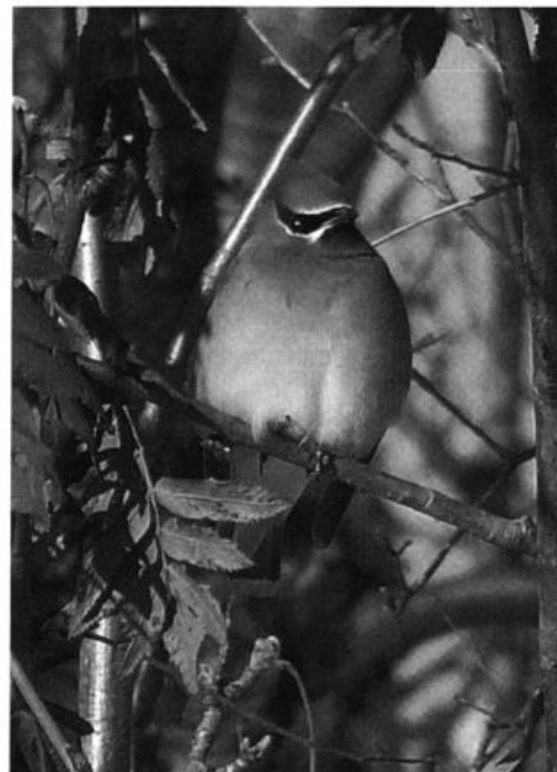
One of at least 12 Cedar Waxwings that hung around an Anchorage neighborhood all season, this bird was photographed in the Regional Editor's yard 25 February 2007. There had been only one prior Cook Inlet winter record.