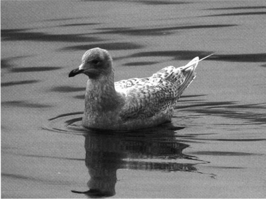
Two Kumlien's Iceland Gulls frequented the Ketchikan, Alaska waterfront in February 2007 (here 8 February), feeding at fish processing plants. This species is casual in the Region, known mostly from a few coastal records in late fall and midwinter.

at Clam Lagoon 10-11 Feb (MT) into Mar. Small flocks or family groups of Whooper Swans are occasional through the winter, usually after Nov at larger fresh water bodies, typically from Amchitka and Adak in the cen. Aleutian Chain. Ketchikan's drake Wood Duck from Nov remained at its favored site through 16 Dec (AWP, ph. SCH), while a pair appeared in Juneau 11 Jan-26 Feb (m.ob.). The season's only Eurasian Wigeon reports were a pair in Juneau 19 Feb (PS) and a single male on the Homer Spit 15 Feb (CS). Notable dabbling highlights, probably neutralized by the heavy Nov freeze, were limited to a few Northern Pintails in the Anchorage area through the season (TT), a hardy Northern Shoveler at a Fairbanks cooling pond through 20 Dec (ABO), and a Eurasian Teal in Cordova 4 Dec (AL). Kodiak however, posted record-high dabbling numbers, including 223 Gadwall, 25 Northern Pintail, and amazing 60 Green-winged Teal on their 17 Dec C.B.C. (RAM). These numbers must have been supplemented by Mainland groups seeking suitable habitat after the Nov freeze. Another Tufted Duck wintered on Cordova's very productive Eyak L. 4 Dec+ (AL), the Region's most consistent Tufted Duck site away from the Aleutians. Although White-tailed Ptarmigan are regular and local in the Chugach Mts., a group of 7 in the South Fork Valley of Eagle R. 23 Dec (BM) made a new Eagle River area C.B.C. high count. These South Fork ravines and the nearby Arctic Valley Bowl are the