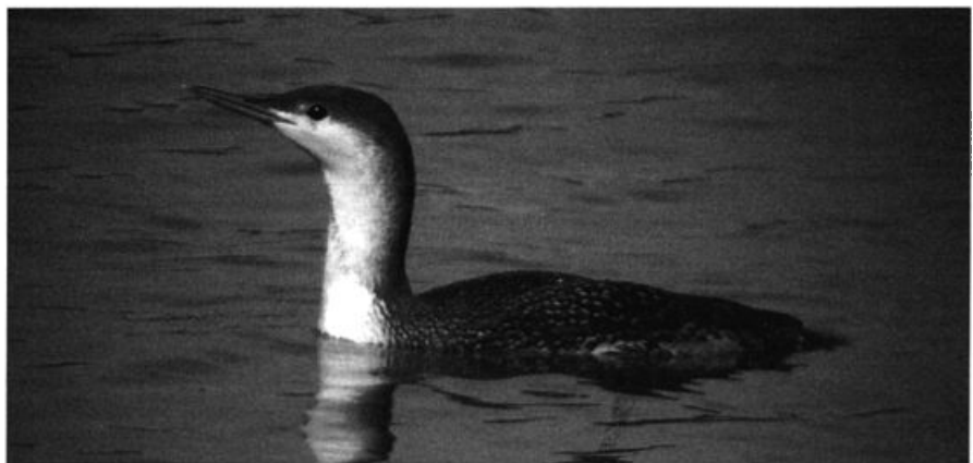
Two Red-throated Loons frequented Bill Williams Delta on the Lower Colorado River 9-26 (here 14) December 2006. There have been fewer than fifteen records of the species from Arizona.