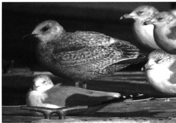
This first-cycle Thayer's Gull at Katherine Landing 7–20 (here 7) January 2007 provided one of the few well-documented records of this species from Arizona.