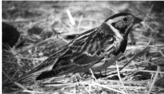
This male Lapland Longspur was discovered wintering in the Sonoita Grasslands near Elgin 12 February 2007; inexplicably, there are fewer than fifteen documented records of the species from Arizona.

Tree Swallows on the Gila River C.B.C. 27 Dec ( vide TC) was high for s. Arizona in winter. A Violet-green Swallow at Gilbert 14 Feb (DP) was likely an early spring migrant, as was a Cliff Swallow at the same location 10–14 Feb (PD). Scattered Barn Swallows were found at s. Arizona locations during Dec, while singles at Santa Cruz Flats 26 Jan (DJ) and at Sweetwater 28 Feb (DS) may have wintered locally. Of the more than 15 Winter Wrens found this winter statewide, 3 were identified by call (and plumage) as "Eastern" Winter Wrens. One was at Huachuca Canyon 3 Dec (RH), one along the S.P.R. s. of Hwy 90 7 Dec–13 Feb (SH), and one was at Tubac 7 Jan (WR). The status of "Eastern" Winter Wren in Arizona is still poorly understood, as identification requires detecting subtle call differences, as well as somewhat variable plumage characteristics.