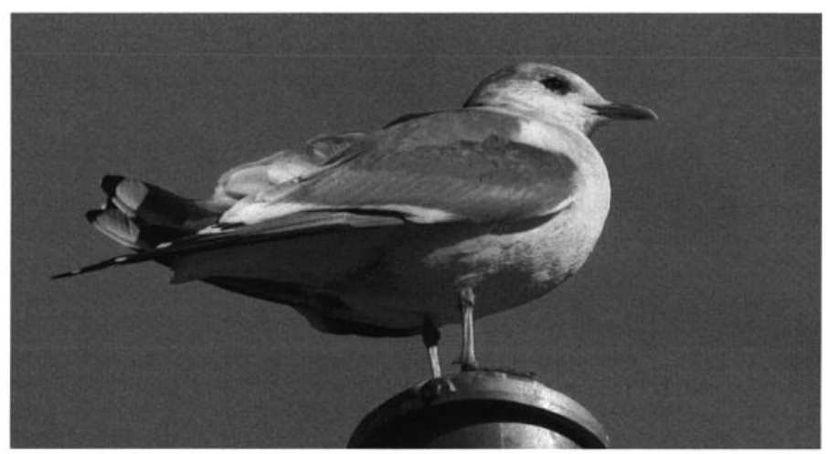
This Mew Gull, one of several observed in the Great Basin this winter, visited Lemmon Valley, Washoe County, Nevada from 14-19 (here 19) February 2007.

Black Phoebes were found n. of their expected range in Rush Valley, Tooele, UT (30 Dec; TA) and Idlewild Park, Reno, Washoe, NV (21 Feb; FP). Moderate numbers of Northern Shrikes were reported this winter from four Nevada counties (Carson, Churchill, Nye, and Washoe) and five Utah counties (Davis, San Juan, Tooele, Utah, and Washington). A Blue Jay was an unexpected Christmas Day surprise at East Canyon, Morgan, UT (KP). Wintering Varied Thrushes were reported in Nevada from Mogul, Reno, Washoe 6 Dec (J&GA) and from Las Vegas, Clark 26 Jan (RS, DG); Utah reports came from the Springdale Pond, Washington (17 Dec-27 Jan; KW, DK et al.), Smithfield, Cache (26 Dec; BR), and the Jordan River Parkway, Salt Lake (22 Jan-2 Feb; RW, PF). A Sage Thrasher was a