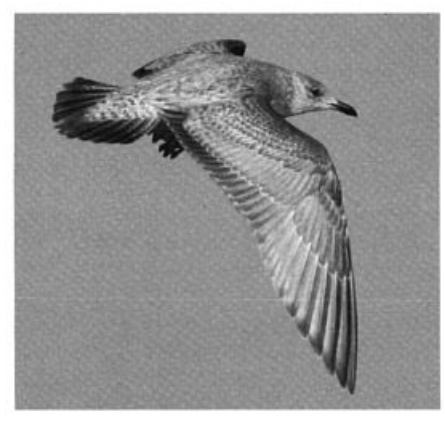
This first-cycle Thayer's Gull was noted at Farmington Bay Wildlife Management Area, Utah 28 February 2007.