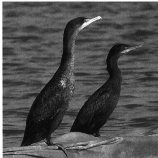
This Neotropical Cormorant (at right) in Muhlenberg County provided Kentucky with its second documented record, although the timing of the one-day sighting (28 February 2007) was much earlier than all previous reports in the Region.