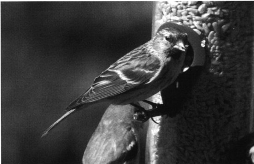
This Common Redpoll spent 18 (here 27) February into March 2007 at Hohenwald, Lewis County, Tennessee; another was in Tipton 9 January through 16 February 2007. There are only a handful of records of this species for the state, and prior to the Tipton bird, none from western Tennessee. Considering the very poor flight of this species south of Canada in this winter, these records are all the more remarkable.

or waves of birds were noted in mid-Jan and early Feb. Only 4 Gray Catbirds were reported in Tennessee, all from the e. half of the state; this is still somewhat high but considerably lower than last winter.