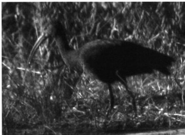
White-faced Ibis is a vagrant at any season in the Tennessee & Kentucky Region, but this individual in Lake County, Tennessee 10 (here 12) November through 9 December 2006 was especially late as well.