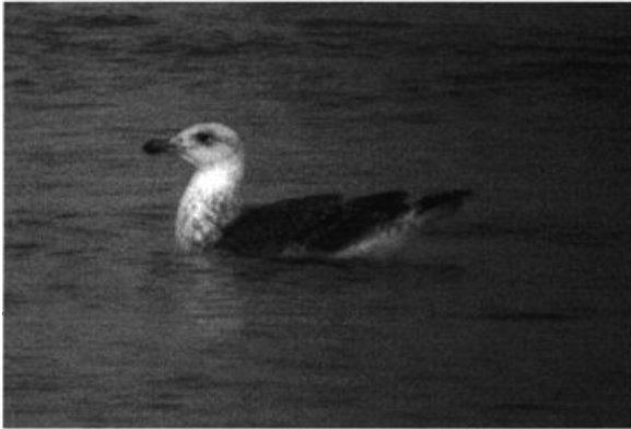
Great Black-backed Gulls, rare in Kentucky, appear to be increasing; this second-cycle bird was present at Kentucky Dam 6 (here) and 7 February 2007.