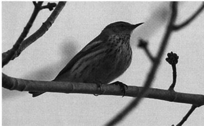
This male Cape May Warbler in Trigg County 16 December 2006 furnished a first winter record for Kentucky.

Eurasian Collared-Doves are still scarce in e. Tennessee n. of Chattanooga, so reports from Washington (DH) and Carter (TM) were noteworthy, as was a first county record for Clay (BHS). The Inca Dove in Hamblen, TN lingered through 14 Dec (BBR). Two to 4 Long-