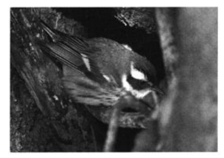
Furnishing the sixth record for Michigan, this Black-throated Gray Warbler at Grand Rapids, Kent County treated birders 17 through 20 (here) January 2007 before being found dead on 21 January.

A female Mountain Bluebird was in Dakota, MN 18-30 Jan (JPM, DAC, m.ob.). Townsend