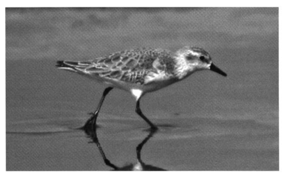
For the second consecutive year, a Semipalmated Sandpiper was verified in Florida, where a few likely winter annually. Photographed at Merritt Island National Wildlife Refuge, Brevard County on 26 January 2007, this was a first for the central region.