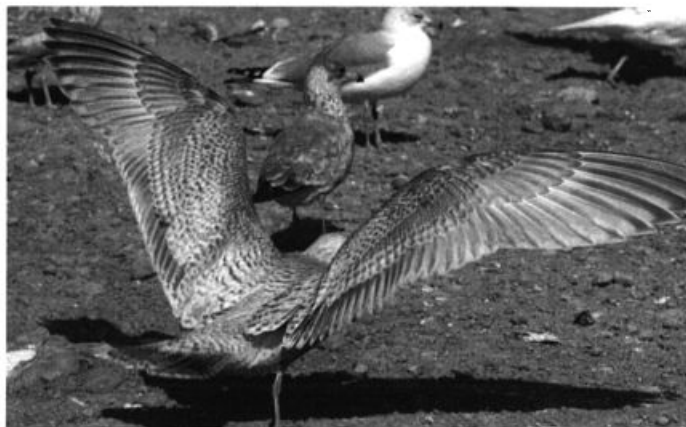
With almost a dozen accepted records for Florida, this Iceland Gull was a one-day-wonder at the Volusia landfill 11 January 2007. The dark tail band, secondaries, and tertials suggest potential admixture with Thayer's Gull genes.