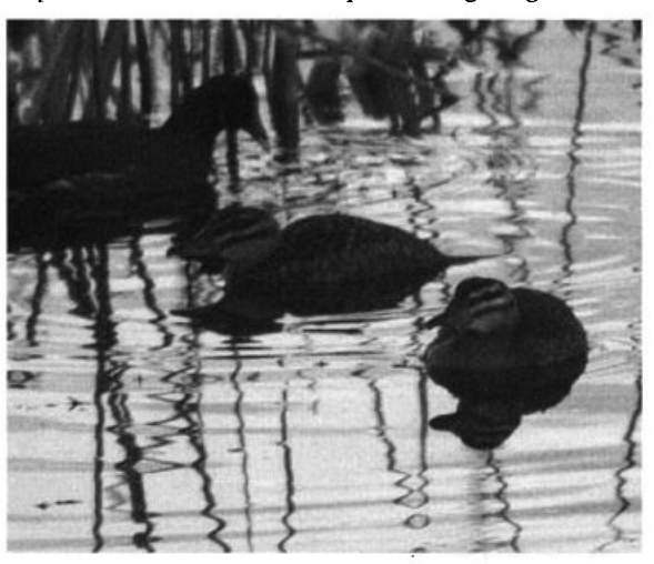
The Masked Duck to the right, present from fall through 29 December 2006 at Viera Wetlands, Brevard County, Florida, was joined by the second Masked Duck 12 (here) through 19 December 2006.

The earliest reports of migrating Swallow-