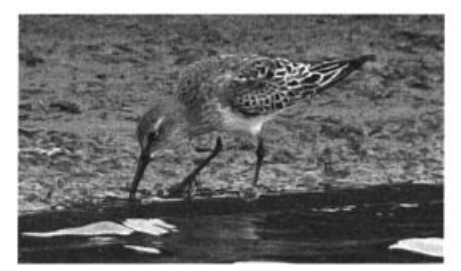
This White-rumped Sandpiper at Kahuku, O'ahu Island, Hawaii 19 (here) through 28 September 2006 provided the first record of the species for the Region.