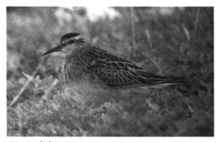
Sharp-tailed Sandpipers are regular visitors to the Hawaiian Islands but are seldom photographed as well as this juvenile, one of two on French Frigate Shoals 13 October (here) through 28 November 2006. One of the two died.