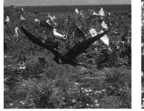
Three Lesser Frigatebirds, seldom reported in the Hawaiian Islands, were observed frequently at ground level on French Frigate Shoals 18 September–28 November (here 29 September) 2006, where more easily distinguished from the larger Great Frigatebirds.

Single Peregrine Falcons were reported at La Perouse Pinnacle, EES. by observers on the NOAA ship Oscar Elton Sette 8-14 Oct, at Kiu