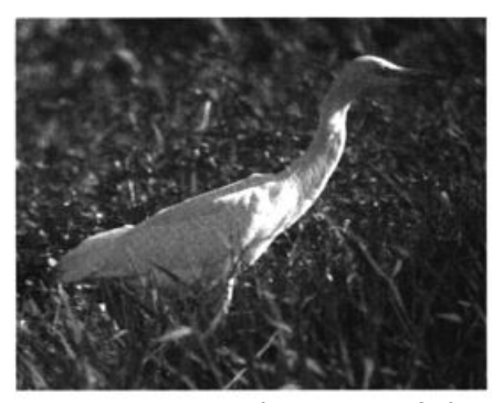
Cattle Egrets are abundant on the main Hawaiian Islands but are uncommon on the Northwestern Hawaiian Islands. This individual, photographed 4 November 2006, remained on French Frigate Shoals through 30 November.