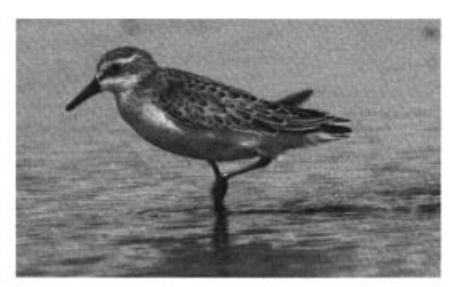
Peeps are uncommon in the Hawaiian Islands, and their relative abundance there is imperfectly understood. At Hanapepe, Kaua'i Island, this photograph of a rare Semipalmated Sandpiper was taken 7 September 2006—good enough to convince even skeptics.