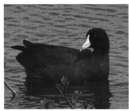
Hawaiian Coot is an Endangered species but is locally common on the main Hawaiian Islands where suitable wetland habit remains. This bird was observed on Laysan Island, over 1300 kilometers from the breeding populations on the main islands.