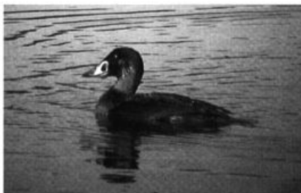
An immature male Surf Scoter was discovered on Mangrove Lake, Bermuda 27 November 2006 (here 22 December) and remained into the New Year, furnishing the ninth record for Bermuda.