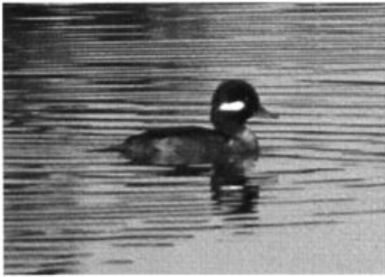
The Bahamas' second (first substantiated) Bufflehead was found in a pond at Ruby Golf Course, Grand Bahama Island, during a pre-Christmas Bird Count scouting trip 13 December 2006 (here). The first report (also of a female-plumaged bird) was from Eleuthera Island in the winter of 1976-1977.