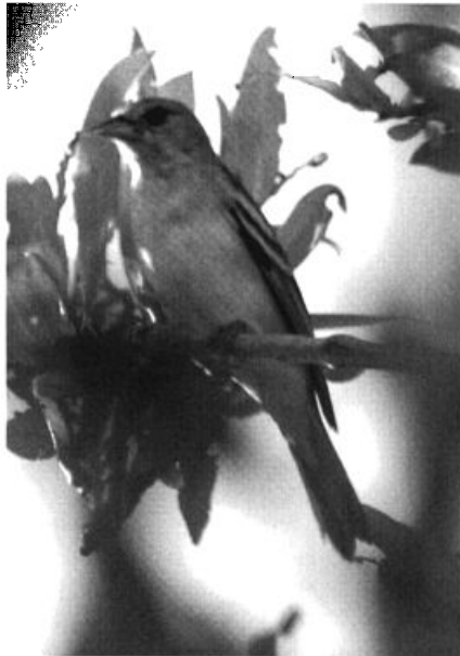
This Baltimore Oriole was found 18 November 2006 (here) at Port-Louis Swamp, Guadeloupe.

dence 4 Oct (TH, RBo), a Tennessee Warbler in Nassau 17 Nov (SB, CW, CI), a Nashville Warbler near the Grand Bahama Highway 30 Nov (BP), 2 Chestnut-sided Warblers near Pelican Pt., Grand Bahama 27 Sep and one at Pinewood Stables, Grand Bahama 29 Sep (both BH, EB), a Swainson's Warbler at Rainbow Farm, New Providence 28 Oct (LH, PD), and Prothonotary Warblers at Rand Nature Centre, Grand Bahama 9 Aug (LM, BP), Reef G.C. 3 Sep (SR), High Rock, Grand Bahama 27 Sep (EB, BH), and the fruit farm, Abaco 30 Sep (BH, EB). At Petite-Terre N.R., Levesque found a Black-throated Green Warbler 27 Sep, a male Black-throated Blue Warbler at 17 Oct, and 19 Northern Waterthrushes, 2 Prairie Warblers, and 16 American Redstarts 6 Oct; he also found a Black-and-white Warbler at Port-Louis Swamp 18 Nov and imm. or female Kentucky Warbler 19 Sep at Gosier, Guadeloupe. A potential first for Bermuda was a briefly seen MacGillivray's Warbler 28 Oct at Paget Marsh (PHo), an imm. or female in a dead cedar at the end of Paget Marsh boardwalk. A Pine Warbler near Rock Sound, Eleuthera 14 Oct (JW, RB, JWu) was s. of its range as a permanent resident in the Bahamas and may have been a rare inter-island migrant. Another potential first for Bermuda was a well-described Western Tanager (DBW) at Ferry Point Park 21 Oct.