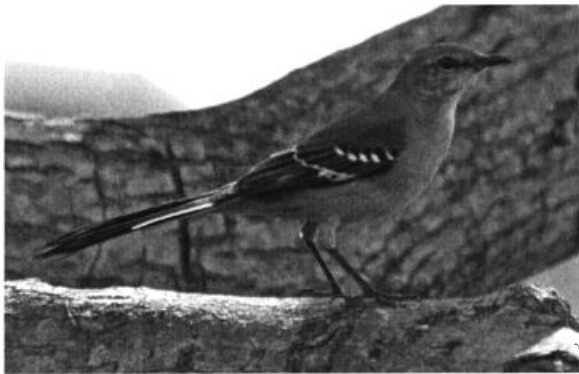
Northern Mockingbird, a rarity in Bermuda, was detected there twice in autumn 2006, including this bird at Boaz Island 26 October 2006 (here).

6th winter (AL). Forty-six Red Knots, a high count, graced Green Turtle Cay, Bahamas 8 Oct (EB). A flock of 23 Semipalmated Sandpipers was unusual at Riddell's Bay G.C., Bermuda 18 Sep (DW). A White-rumped Sandpiper was at West End, Grand Bahama 26 Sep (BH, EB). On Guadeloupe, single Up-land and Buff-breasted Sandpipers were present at Pôle Caraïbe Airport 14 Sep (AL). On 10 Sep, an oiled Baird's Sandpiper was on Riddell's Bay G.C., Bermuda (DBW, EA), where a Dunlin spent early through mid-Oct; another Dunlin was at nearby Spittal Pond 24 Oct (DBW). A Long-billed Dowitcher was at Jubilee Rd., Bermuda 17 Oct (EA). Bracey reported about 10 Long-billed Dowitchers at Angelfish Pt., Abaco 23-24 Oct (vt. EB); this is the first documented report from Abaco and 3rd for the Bahamas.