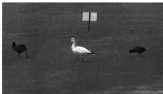
A Ross's Goose at Reef Golf Course, Grand Bahama Island, Bahamas 18 November 2006 (here) provided a first record of the species for the country and for the West Indies.

Nov (10 hours) from Petite-Terre N.R., Guadeloupe produced 11 Cory's Shearwaters, a Black-capped Petrel, and 2 unidentified Pterodroma . A late White-tailed Tropicbird was over Darrell's I., Bermuda 22 Oct (AD, PW). Three Masked Boobies were seen off the East End, Bermuda 14 Sep (PW), probably the result of Hurricane Florence , which skirted the island 10 Sep; another was seen 17 Oct, also off the East End, Bermuda (PW). Single Brown Pelicans in the Bahamas at Warderick Wells, Exumas 4 Aug (LD), Clifton Cay, New Providence 10 Sep (MD), and Montague Foreshore, New Providence 20 Sep (LG) were unusual. On Barbados, a juv. Brown Pelican took up residence in Bridgetown by the Main Bus Terminal 23-30 Sep (MF, EM). Grand Bahama's first 2 Neotropical Cormorants found at Reef G.C. 26 Sep were last seen 18 Nov (BH, EB, BP, PB). An Anhinga nest with 2 ads. and 3 young on Paradise I. 10 Sep (ph. PD) established the first nesting record of the species for the Bahamas; 3 female/young were seen there 17 Nov (CW, CI).