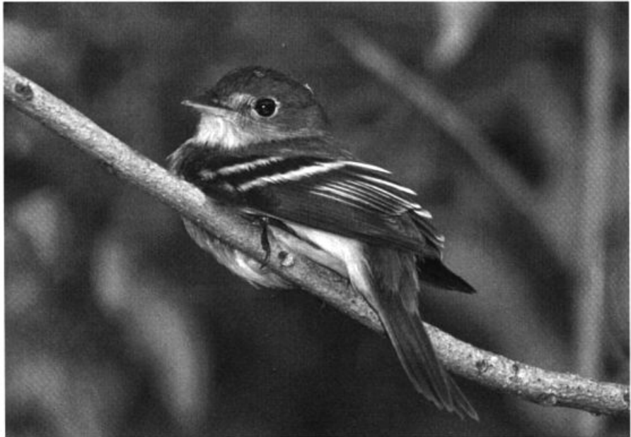
Empidonax flycatchers are regular migrants in Bermuda but not always identifiable to species. This probable Alder Flycatcher (heard vocalizing) was photographed 17 September 2006 at Riddell's Bay Golf Course.