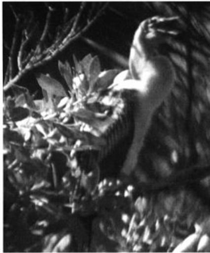
This fledgling Anhinga (here 10 September 2006) was one of two young produced in the first nesting of this species in the Bahamas. The nest was at Lakeview Ponds on crowded, touristy Paradise Island.

In Bermuda, single American Bitterns were at Cloverdale 14 Oct (DBW) and in Paget Marsh 29 Nov (DW); in the Bahamas, others were at Shannon G.C. and along Midshipman Rd., Grand Bahama 7-9 Oct (GK, BP, PB) and at Harrold & Wilson Ponds N.P., New Providence 25 Nov (PD, LH, KHL, LL). Single Least Bitterns were seen at Pitman's Pond 14 Oct (AD) and Cloverdale, Bermuda 24 Oct (AD). The long-staying Gray Heron in Bermuda was present throughout the period, mainly in the Tuckers Town area. A Tricolored Heron was noted at Port Louis Swamp, Guadeloupe 14 Sep (AL); at Petite-Terre N.R., the first Great Egret was recorded for the reserve 14 Sep (AL). An imm. Black-crowned Night-Heron was seen at Spittal Pond, Bermuda during Oct (AD, PW). At Port-Louis Swamp, Guadeloupe, a juv. Black-crowned Night-Heron was found 26 Nov (AL); at Martinique, 4 were present at Le Robert 7-26 Nov (VL).