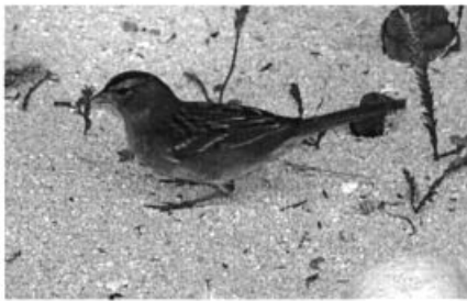
Following on the heels of Central America's first White-throated Sparrow on Belize's Half Moon Caye in May 2005 was this White-crowned Sparrow, Belize's second, found in virtually the same spot on 5 November 2006.

A Common Yellowthroat on Caye Caulker 28 Aug and a Summer Tanager there 1 Sep (J&DB) were early migrants; conversely, a male Scarlet Tanager in Punta Gorda 23 Nov (LJ) was the latest fall migrant on record for Belize. An imm. Golden-crowned Warbler banded 29 Aug in a coffee plantation in Izalco (VG, ph. RJ) was either a rare migrant or a disperser. The nearest known breeding population is at Apaneca, about 20 km to the west. A male Scarlet Tanager at San Ignacio 14 Oct