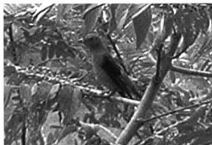
Although reported almost annually now, Scarlet Tanagers had not been photographically documented in El Salvador until this male, the country's fifth record, was found 14 October 2006 at San Ignacio, Chalatenango Department.

2004, it was likely overlooked, as it is relatively quiet in winter and typically perches low in tall grasses, where it can be missed by those unfamiliar with its distinctive call. The