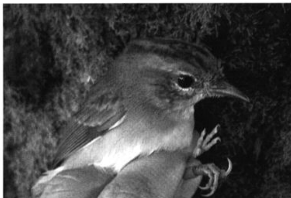
An immature Golden-crowned Warbler captured 29 August 2006 at a coffee plantation in Izalco, El Salvador was 20 kilometers from the nearest known breeding population. Although likely a disperser from a local population, migration in the species is also a possibility.

country. On 15 Nov, the monitoring station at the Santa Ana Volcano in Santa Ana , El Salvador captured a female Amethyst-throated Hummingbird (ph. VG), the first record for Los Volcanes N.P., and an apparent vagrant some 50 km from the nearest known population. Rarely reported in Guatemala's Sierra Sacranix, a male Sparkling-tailed Hummingbird was found at 1500 m in Sanimtacá, Alta Verapaz 22 Aug (EPC).