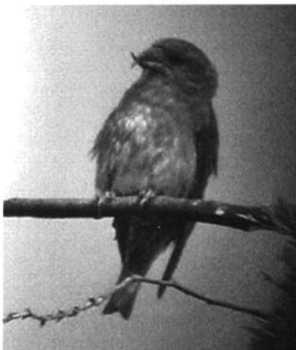
Apparently resident in the northern mountains of El Salvador, this Red Crossbill photographed 15 October 2006 at San Ignacio, in Santa Ana department, nonetheless represents just the sixth record for the country.

Individual Blue Seed eaters were banded 1 Aug (a juv.), 4 Oct, and 8 Nov at the monitoring station in El Imposible N.P. (ph. LA). Of the 10 seed eaters captured at the station since its inauguration in Nov 2003, 5 were in 2005 and 5 in 2006, all after a massive bamboo seeding event in Nov 2004 in the hills above the station. The juv. captured 1 Aug this year provided the best evidence so far