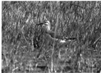
Two Wilson's Phalaropes were found in the Blue Creek rice fields, Orange Walk District, Belize 3 September 2006, adding to three previous records for the country, one in fall and two in spring.