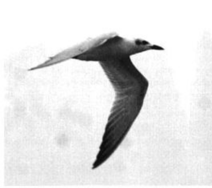
Gull-billed Terns are locally fairly common along the coast of Belize, principally at shrimp farms and a few kilometers inland at Crooked Tree Wildlife Sanctuary, but this one at the Blue Creek rice fields, Orange Walk District 5-9 (here 6) September 2006 (with 2 there on the 9th) provided the only truly inland record for the country.

but no photographs were previously obtained. Three King Vultures were seen from the TELCOR tower site at 600 m on the La Virgen/San Juan del Sur road in Rivas 30 Nov (JM), and single individuals had been reported in the area in the preceding four weeks (LL, PS). This species is local and rare in Nicaragua, and existing populations are not