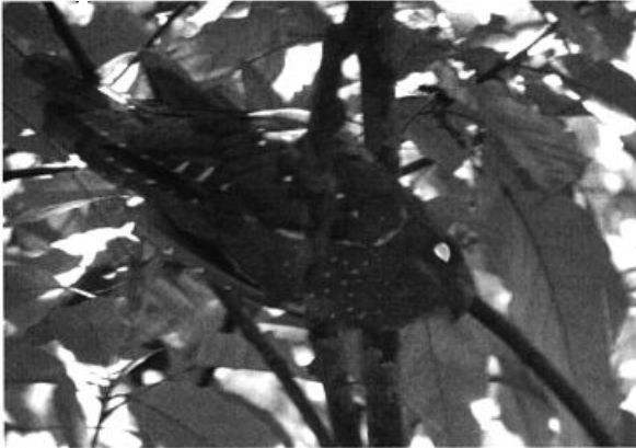
Providing the third documented and first lowland record for Costa Rica (and the first to be found alive) was this Oilbird found in Sector Madrigal, Corcovado National Park, Puntarenas on 3 October 2006. Previous records were of a desiccated corpse found under a powerline on Cerro de La Muerte and a road-killed bird found at Monteverde.