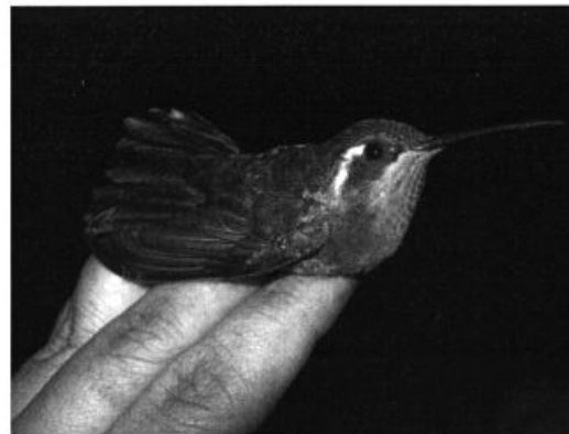
Ornithologists have intensively surveyed and monitored the cloud forests of the Santa Ana volcano complex in El Salvador since the 1920s, without ever recording an Amethyst-throated Hummingbird. This female captured at a permanent monitoring station 15 November 2006 was apparently a vagrant or disperser, perhaps from Montecristo cloud forest 50 kilometers to the north. One month later, the monitoring station captured two additional males, so perhaps we are witnessing a colonization event.

on the Azuero Pen. Also at Cobachón on 5 Aug (MD) were 5 Painted Parakeets. This species is rarely reported in its restricted range in Panama. A Black-billed Cuckoo was photographed at 2000-m Dota, Cerro de la Muerte 5 Oct (PM). This relatively rare migrant is not often reported away from the