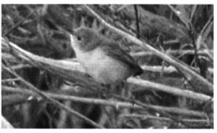
This Prothonotary Warbler showed up 21 April 2006 at Ciénega de Juana Ruiz, near San Miguel de Allende, Guanajuato.

rant (red-billed and red-legged) Laughing Gull was still at Río Lagartos in early Oct; it now has a black gape and bill base (DN, HGdS, vt. JdH, ph. LT). A Herring Gull was in Celestún as early as 2 Aug (AD), and a Common Tern, predominantly a transient on the peninsula, was at a tern roost near Las Coloradas 1 Oct (HGdS, JdH, IN). Three Blue Ground-Doves each were at Yoactún 27 Nov and at Chunhuas the next day (HGdS, MPV), while a White-crowned Pigeon was banded at Akumal 22-27 Sep (AR, WS). Three Eurasian Collared-Doves were in Tulum 25 Sep (HGdS, JdH), and one was at a Pemex station near Mérida airport 26 Nov (BD, LD, WD, CZ). Guatemalan Screech-Owl was abundant and very vocal along the Vigía Chico rd. 26 & 27 Sep, but on the same dates, only one Yucatan Poorwill was heard, and Yucatan Nightjar was silent (HGdS, JdH, LT). An abandoned Lesser Swallow-tailed Swift nest at the Ejido Reforma Agraria, O. Roo water tower 25 Nov (HGdS, MPV ph.) represented one of very few records from the Peninsula, previ-