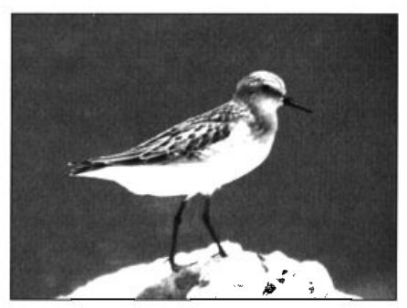
Recorded on Cozumel Island, Quintana Roo only once before, this Semipalmated Sandpiper was photographed near Punta Celaraín 24 September 2006.