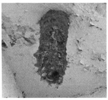
A Lesser Swallow-tailed Swift nest was found 25 November 2006 at Ejido Reforma Agraria, Quintana Roo, one of only three records of this species from the Mexican portion of the Yucatan Peninsula.

A King Vulture flew over Calakmul 23 Nov (LD), while an ad. and imm. were at Yoactún,