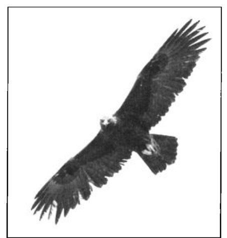
Two Golden Eagles were found 10 kilometers into Oaxaca state along the Puebla/Oaxaca highway 15 November 2006; the species is quite rare so far south in Mexico.

Three Muscovy Ducks were seen near San Blas (w. of the Sewage Pond Trail), and 5 more were just n. of Singayta 24 Nov (DS). Three white-morph and one imm. dark-morph Snow Geese and a female Hooded Merganser were in the golf course ponds at Puerto Peñasco, Son. 17 Nov (KC, MC et al.). A juv. Brown Pelican was found dead at km 99 of the hwy. between Sonoyta and San Luis Río Colorado, Son. 27 Jul (GR). An imm. Little Blue Heron was recorded in Cañón de Fer-